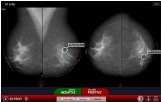
Figure 1. Screenshot of the BREAST assessment system. In this case the user diagnosed cancers in a normal case. In practice this may result in an unnecessary and expensive biopsy procedure and significant stress to the patient.

(Medical Xpress) -- The University of Sydney, in partnership with BreastScreen NSW and Ziltron, has developed a pioneering web-based program to monitor the performance of radiologists in detecting and diagnosing abnormalities in breast X-rays. Currently commencing its nationwide rollout, the BREAST Project has the potential to improve the early detection of breast cancer through screening and in turn reduce breast cancer mortality and morbidity.