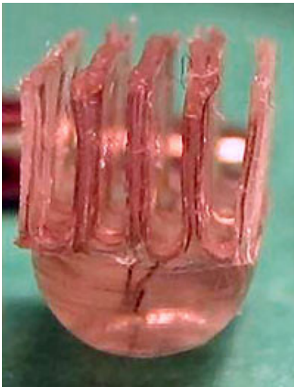
The active electrode book

Engineers have developed a new type of microchip muscle stimulator implant that will enable people with paraplegia to exercise their paralysed leg muscles.