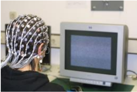
Participant with EEG head net taking part in the study.

The scientists have thus confirmed previous studies, according to which people perceive moving objects better if they already know in which direction the objects will move.