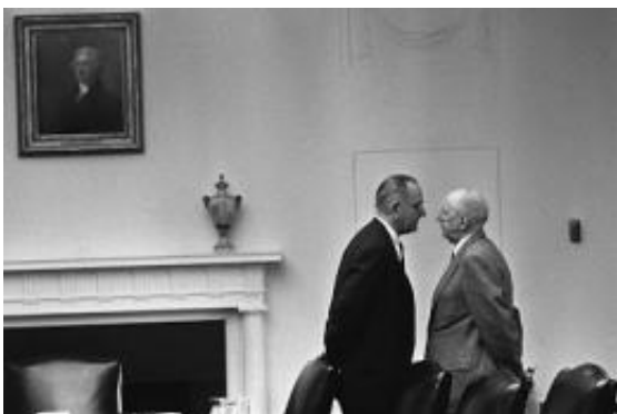
Lyndon B. Johnson giving "the treatment" to Georgia Senator Richard Russell.