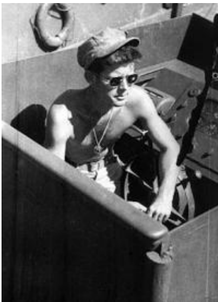
John F. Kennedy in PT-109 during his Navy years.