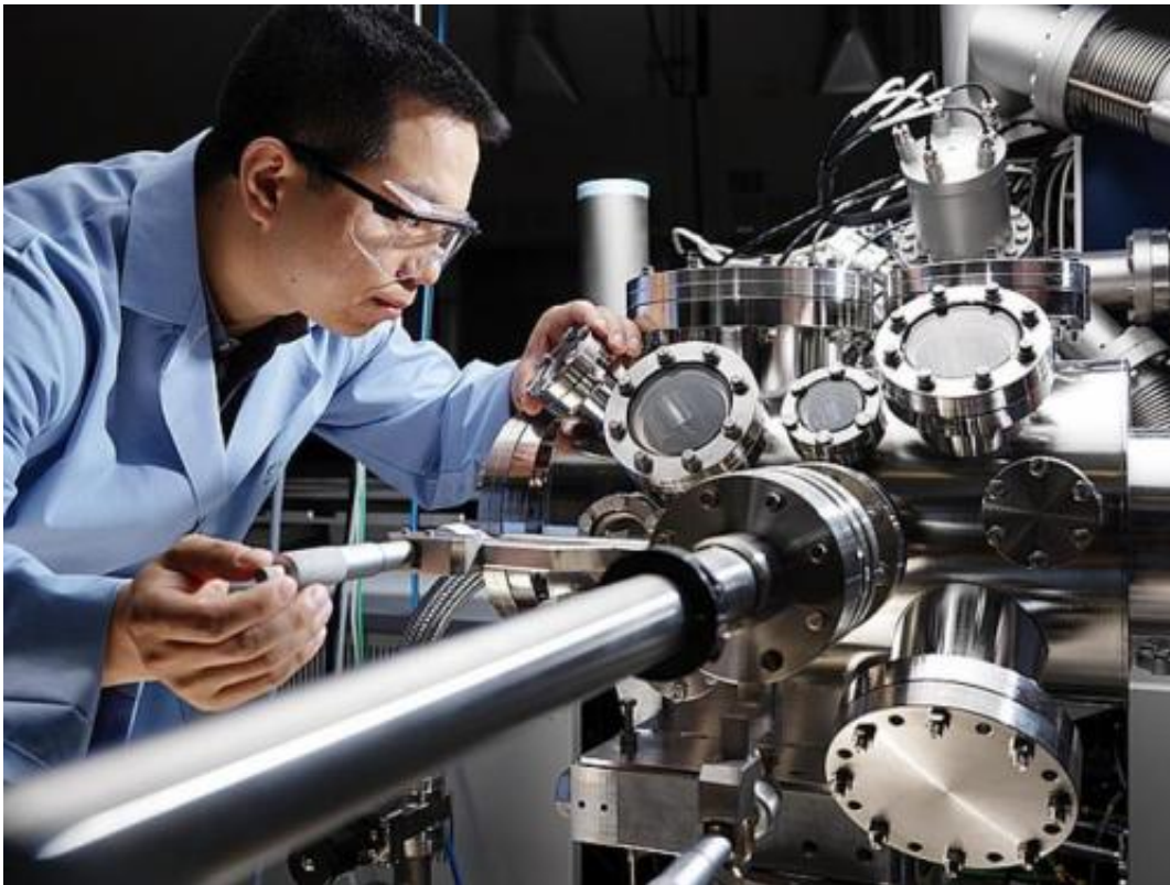
Mass spectrometer.

Each metabolite in the mix is made up of a unique combination of chemical elements, which gives it a characteristic mass.