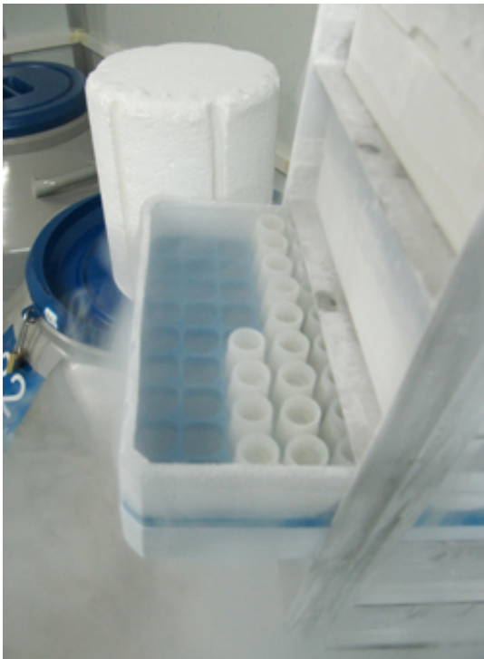
A modern sperm bank in China.

Pralat's research explores two challenges that face British healthcare: the shortage of 'high-quality' sperm, with many donation programmes relying on supplies from overseas, and the 'surplus' of infected semen, with new HIV infections among gay men at an all-time high. He said: "It's ironic that while fertility clinics struggle to provide their services because of the lack of sperm, the uncontrollable spread of semen poses the main challenge for HIV prevention." Pralat will ask whether the two areas of scientific study and clinical practice can learn anything from each other in addressing these challenges.