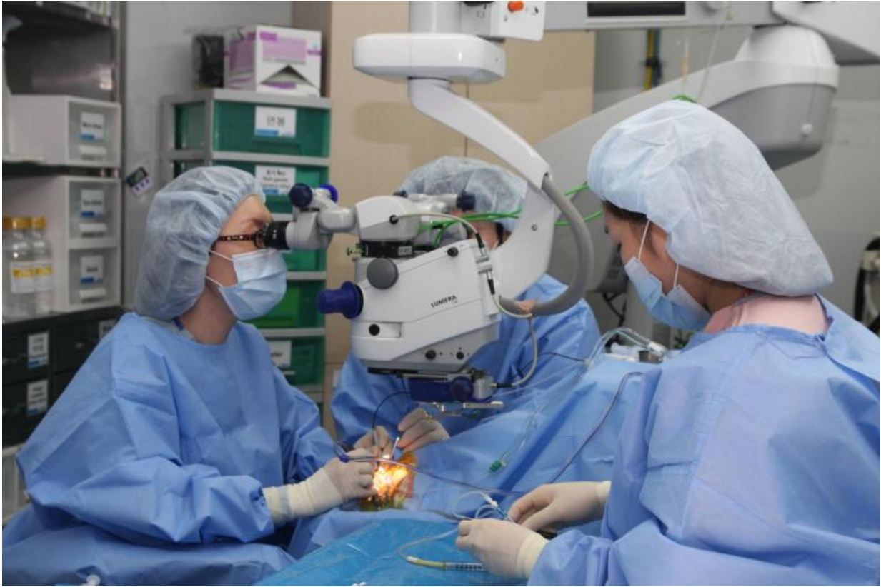
Photograph of the CHA Biotech Co., Ltd. team in the operating room.