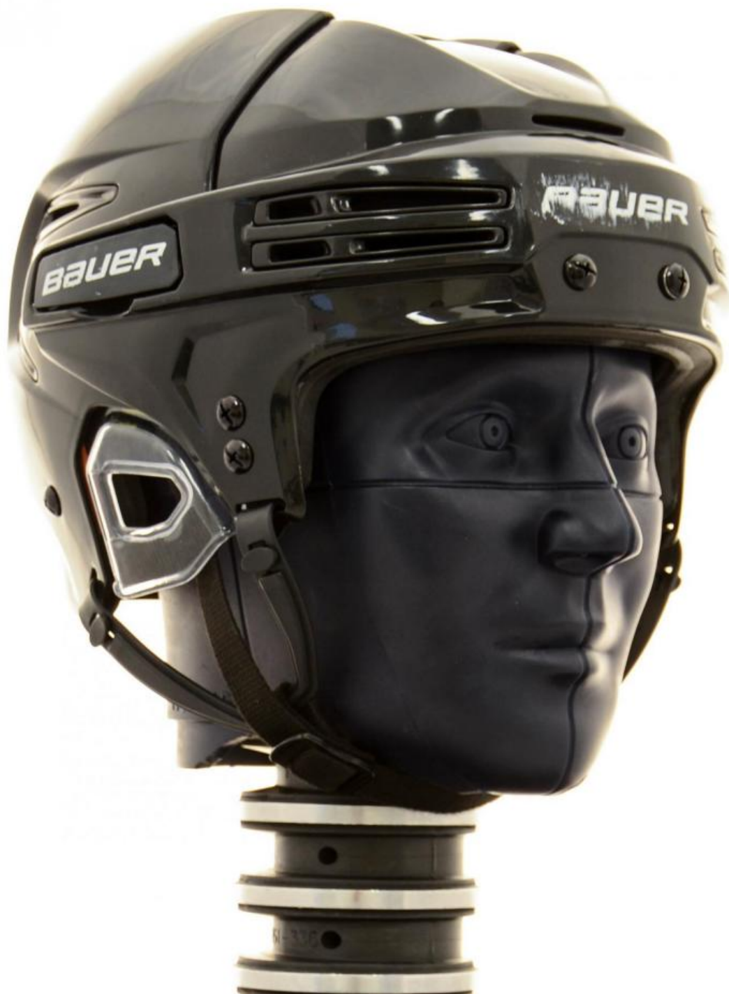
Bauer RE-AKT 75