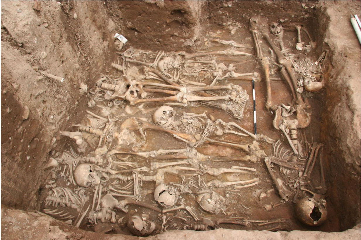
A Photo of a mass burial site in Ellwangen, Germany.

After analyzing DNA extracts from the teeth of 178 individuals, the researchers identified Y. pestis DNA in extracts from 32 individuals. Three individuals from Barcelona, Bolgar City, and Ellwangen had sufficient Y. pestis DNA for genome-level analysis. The researchers sequenced the genomes of these three ancient Y. pestis strains and compared them to 148 previously sequenced ancient and modern strains to reconstruct the Y. pestis phylogenetic tree.