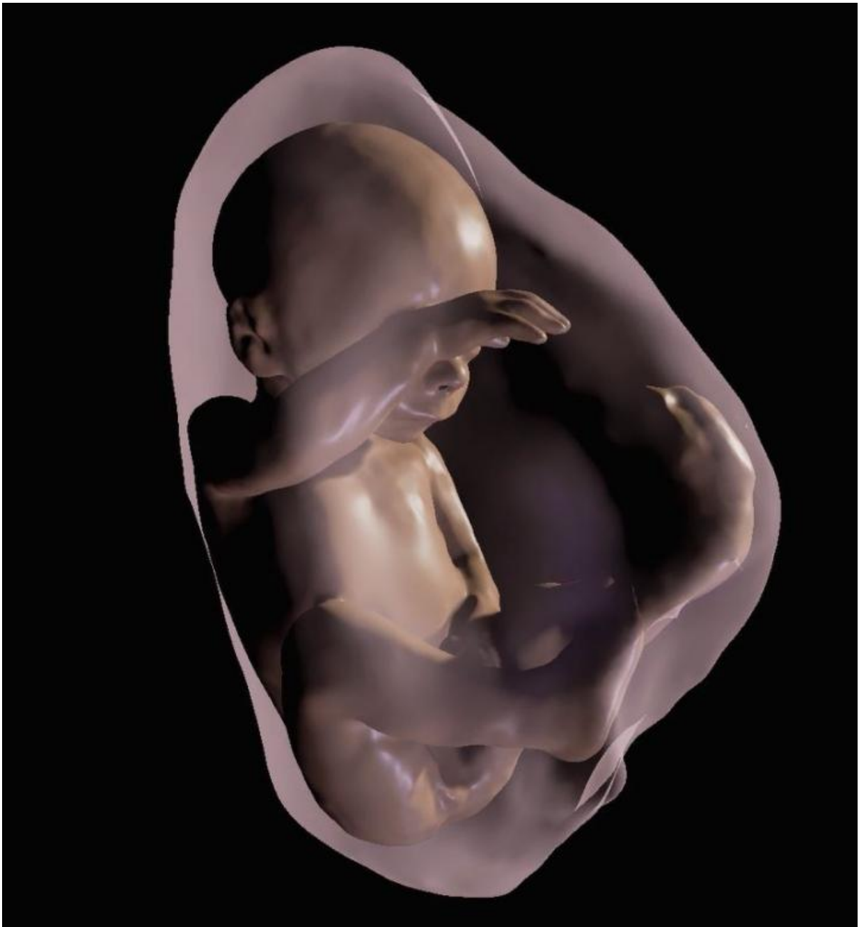
Figure 2: This is a 3-D virtual model MRI view of fetus at 26 weeks.

internal structure of the fetus, including a detailed view of the respiratory tract, which can aid doctors in assessing abnormalities.