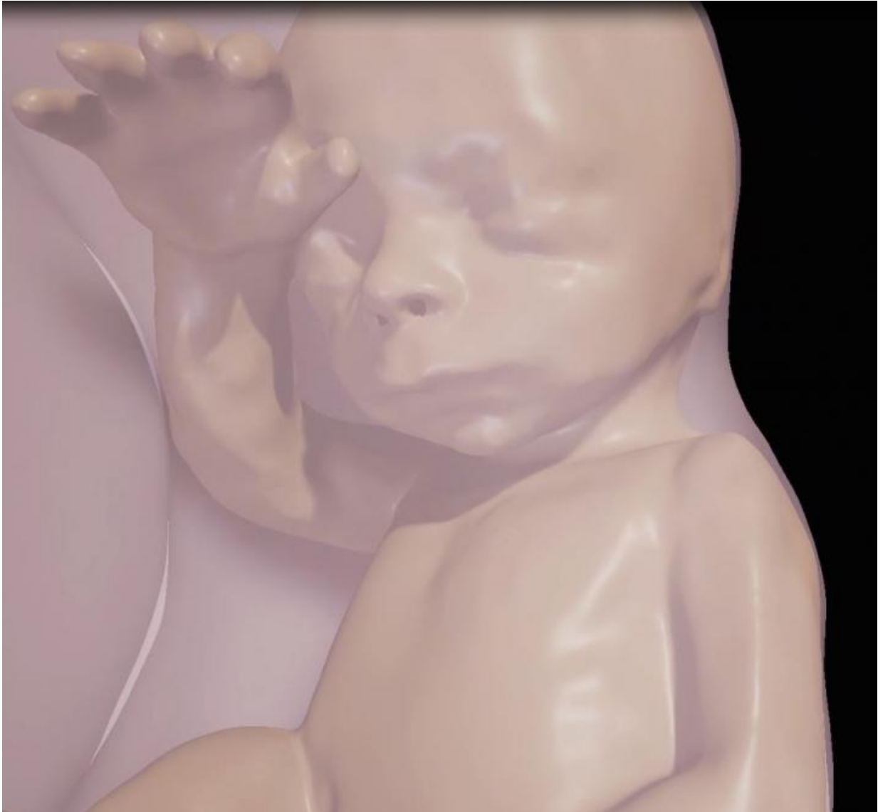
Figure 3: A close-up of fetus at 26 weeks.