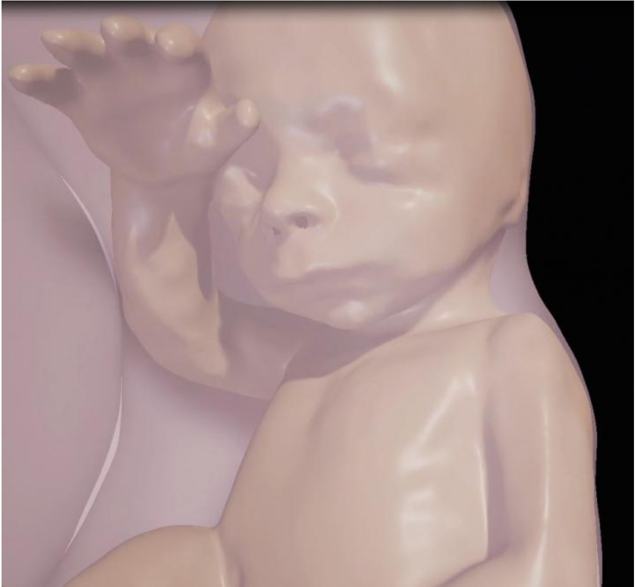
Figure 3: A close-up of fetus at 26 weeks.