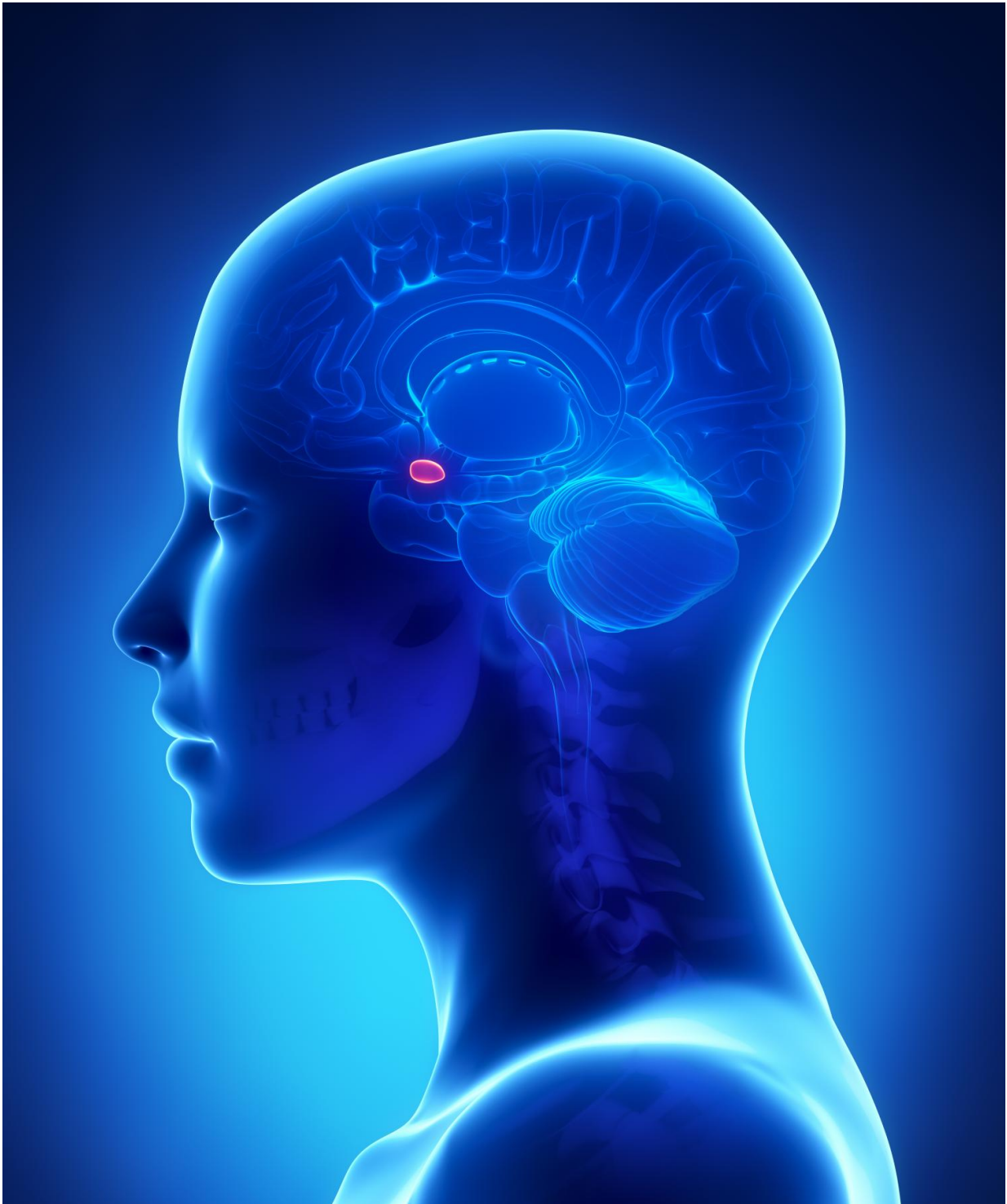
Amygdala.