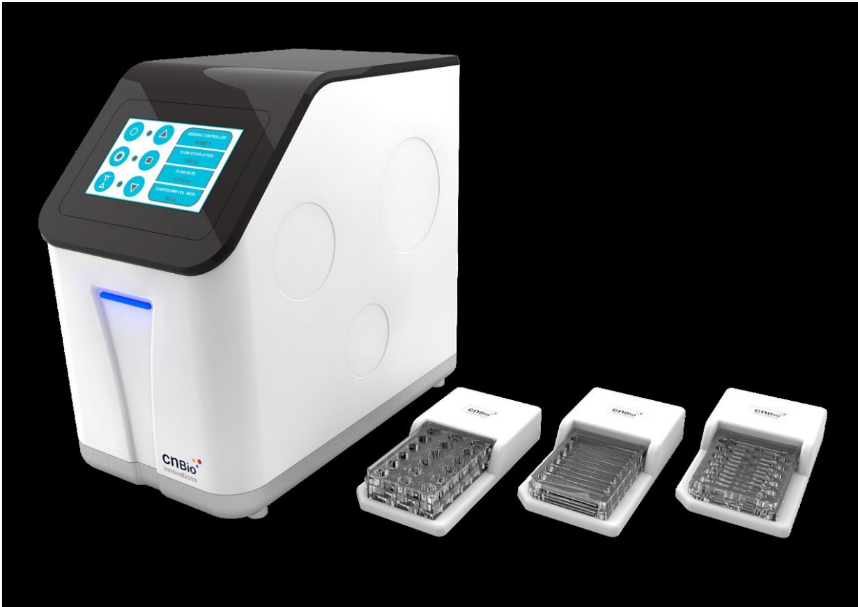
Microfluidic liver culture platform.

Hepatitis B is very infectious and causes liver cancer and cirrhosis. Thus, the researchers say, it was the best virus to use for the first test as its interactions with the immune system and liver cells are complex, but with devastating consequences for the tissues.