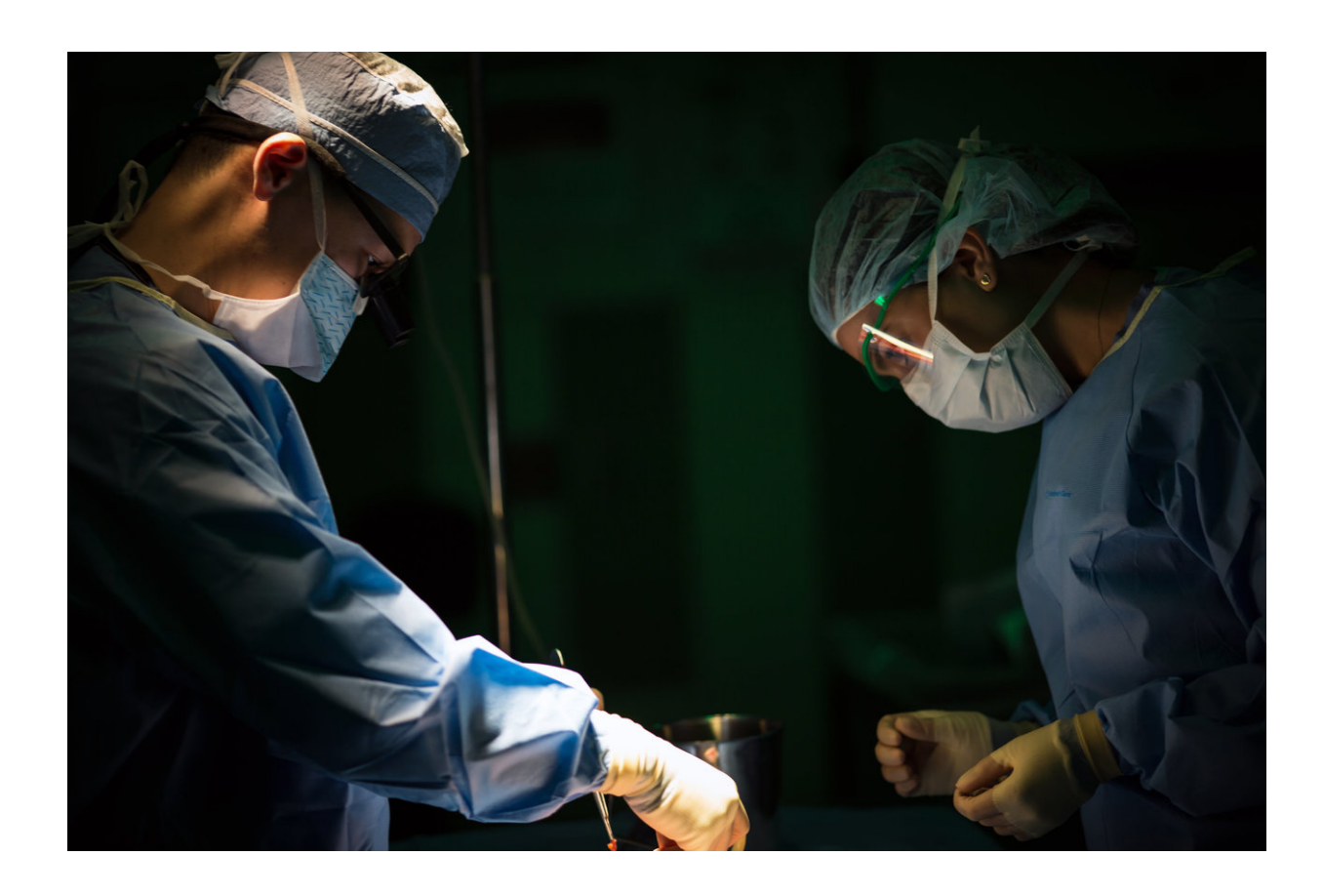
Transplant operation.

As the government invests millions to combat the <u>opioid epidemic</u>, the transplant community does not plan to rely on drug-<u>intoxication</u> deaths as a long-term source of donations.