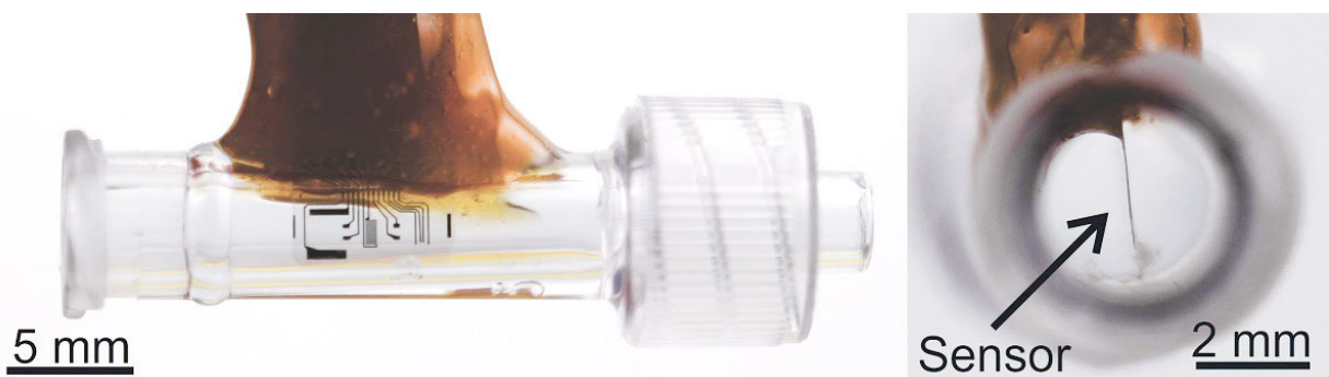
Sensors packaged for tests at Children's Hospital Los Angeles.

What's more is the significant delay and expense patients incur to diagnose if their shunt has failed and differentiate it from other ailments with the same symptoms, like the flu. Baldwin said the current process can take multiple brain scans over a period of months and an invasive procedure called a "shunt tap."