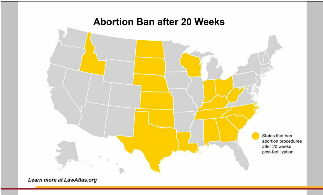
Map illustrating state laws that ban abortion after 20 weeks post-fertilization.

The datasets were created for the Abortion Law Project , through a collaboration between the Policy Surveillance Program at Temple University's Center for Public Health Law Research, Guttmacher Institute, Resources for Abortion Delivery (RAD), American Civil Liberties Union, Center for Reproductive Rights, National Abortion Federation, and Planned Parenthood Federation of America.