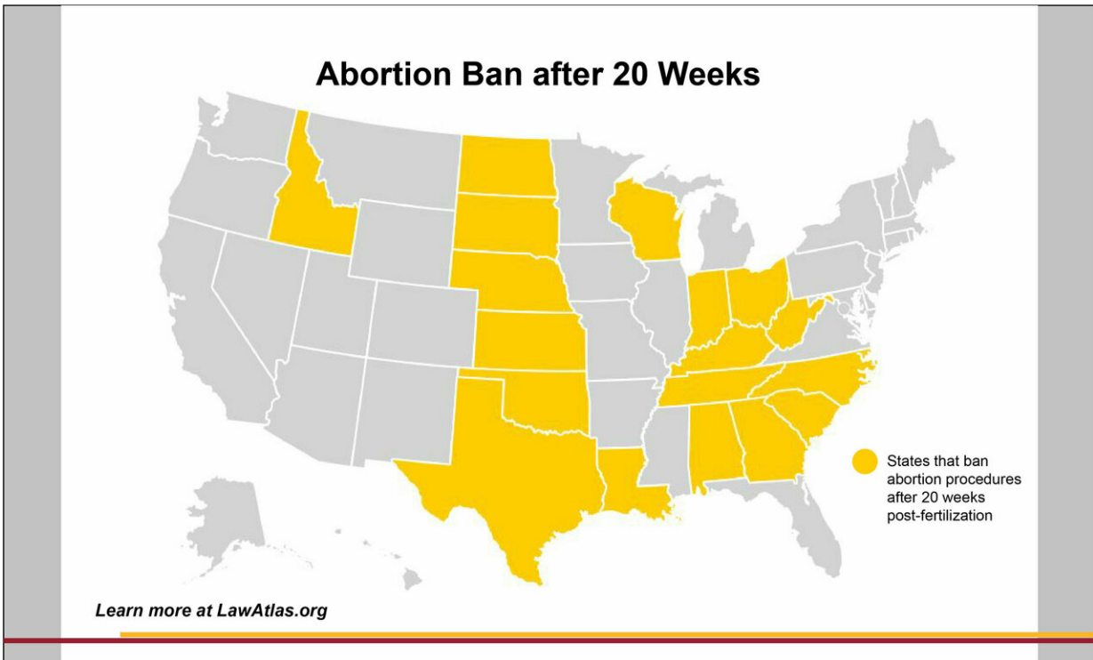
Map illustrating state laws that ban abortion after 20 weeks post-fertilization.

The datasets were created for the Abortion Law Project , through a collaboration between the Policy Surveillance Program at Temple University's Center for Public Health Law Research, Guttmacher Institute, Resources for Abortion Delivery (RAD), American Civil Liberties Union, Center for Reproductive Rights, National Abortion Federation, and Planned Parenthood Federation of America.