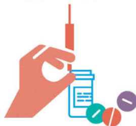
ONTARIO RATES OF HYDROMORPHONE PRESCRIPTION AND INFECTIVE ENDOCARDITIS RISK

Infective endocarditis is an infection of the inner lining of the heart that can be life-threatening. It can occur from re-using or sharing injection equipment.