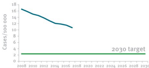
Total EU/EEA TB notification rate over time, and the 2030 target: 80% reduction compared with 2015.