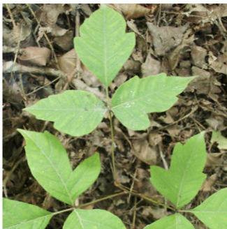
poison ivy (summer)