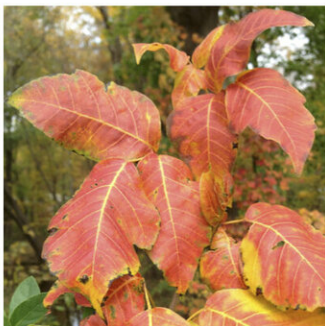
poison ivy (fall and spring)