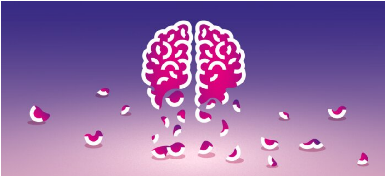
Illustration. Alzheimer's.

A team of scientists from the Moscow Institute of Physics and Technology (MIPT) and Shemyakin-Ovchinnikov Institute of Bioorganic Chemistry (IBCh RAS) studied one hereditary genetic mutation to discover general molecular mechanisms that may lead both to early onset of Alzheimer's disease and to the form of the disease caused by age-related changes in human body. Understanding these mechanisms is necessary for developing new targeted treatments for this