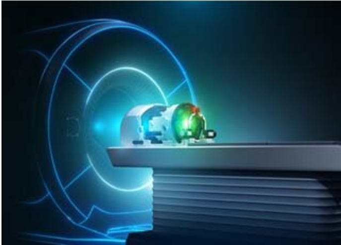
MRI Exablate neuro helmet from INSIGHTTEC.