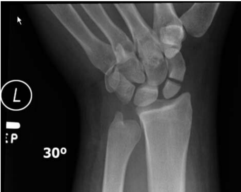
X-ray image of a fracture of the scaphoid bone in the left wrist.