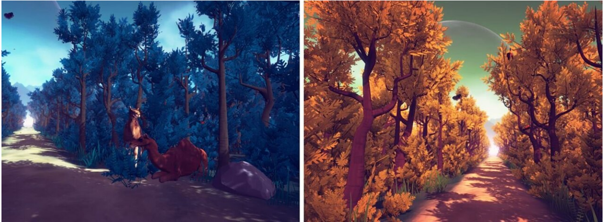
Screenshots of the virtual woods.