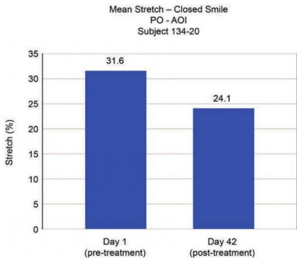
Fig. 5. Objective facial dynamic results (three-dimensional stereophotogrammetry) in representative subjects. Subject ID 134-20, aged 58 years, with closed smile (maximum contraction), treated with Restylane Defyne. Total injection volume in nasolabial folds and marionette lines = 4.4 ml (nasolabial fold = 2.5 ml; marionette line = 1.9 ml).