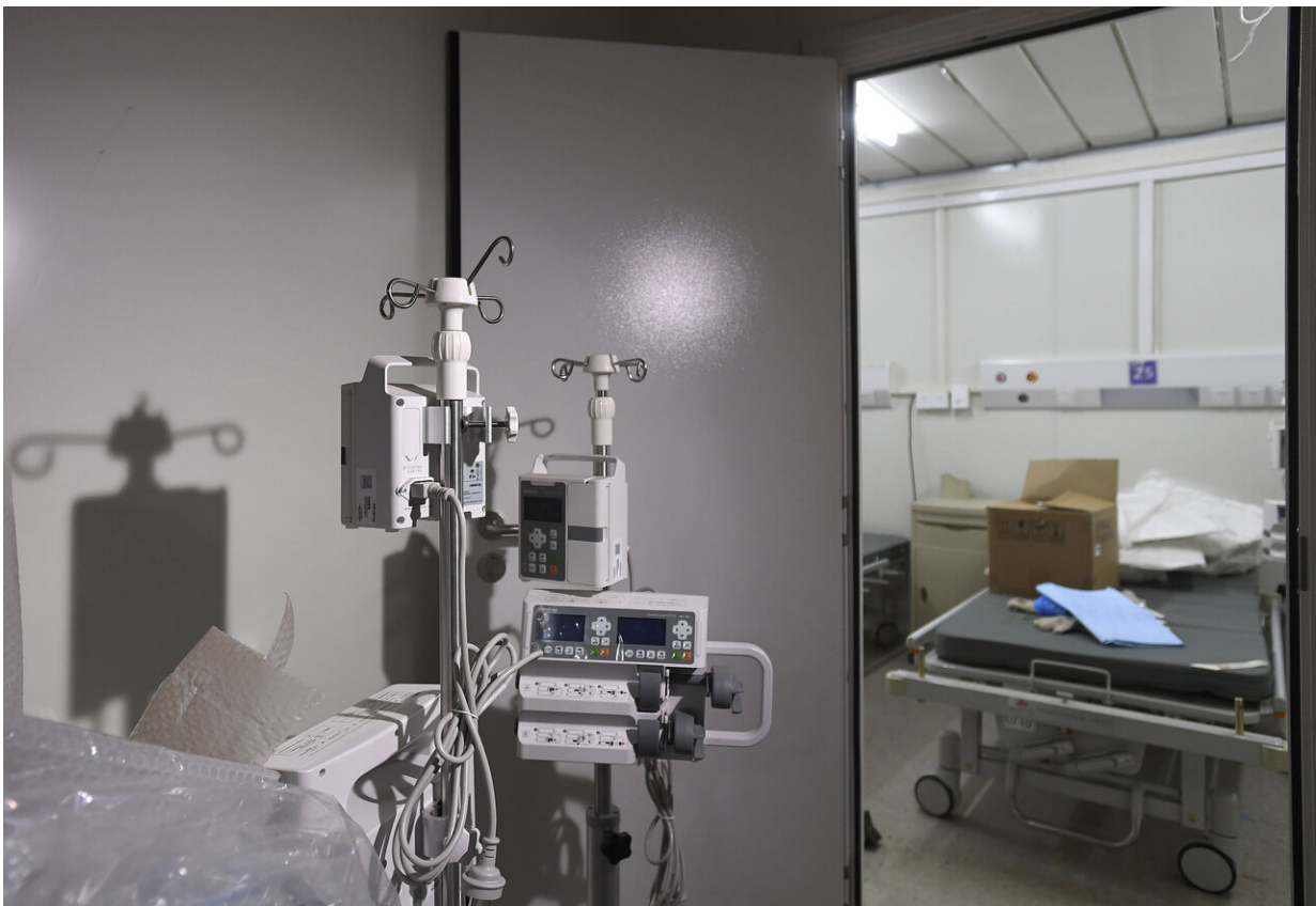
Medical equipment is seen at the Huoshenshan temporary field hospital in

Before this week's addition of 2,500 new beds, Wuhan had 6,754 in hospitals designated for virus patients, according to the website TMTpost.com. It said authorities were considering assigning another 2,183 beds to virus cases at the city's other hospitals.