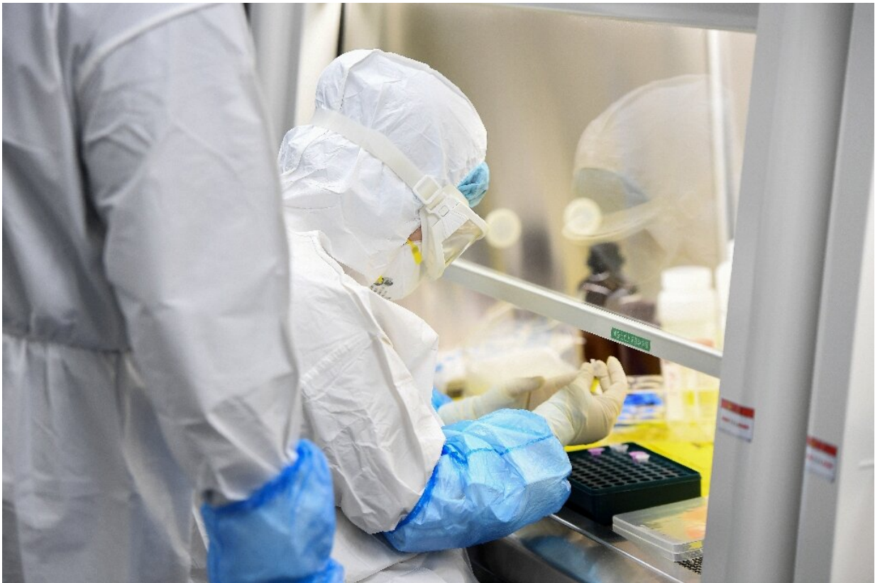
A laboratory technician works on coronavirus samples at "Fire Eye" laboratory in Wuhan

Medical staff are overstretched and lack sufficient protective gear, the deputy governor of Hubei province admitted Thursday.