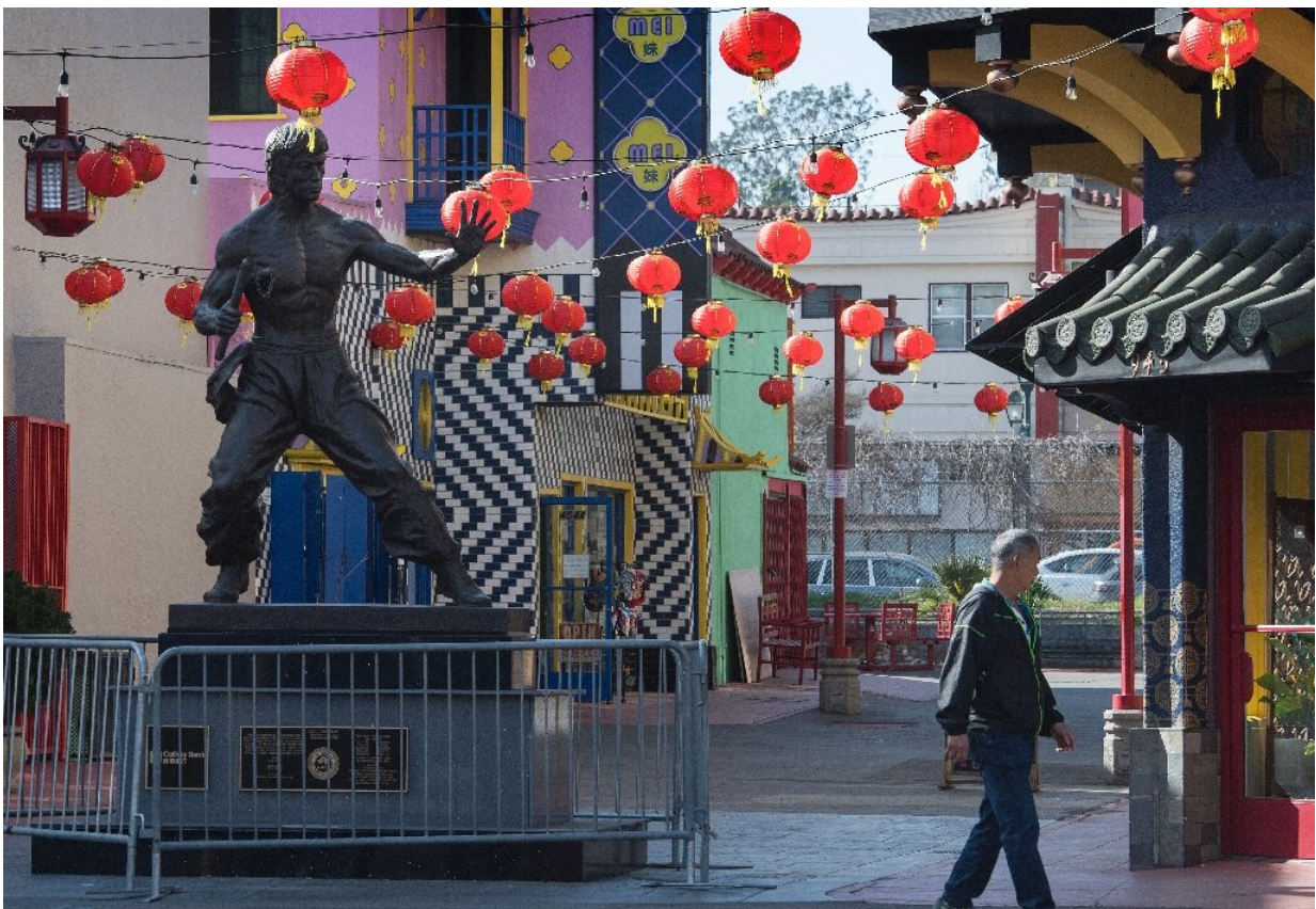
A man walks through an almost deserted Los Angeles Chinatown as most stay

While the WHO has praised China's handling of the epidemic—in contrast to its cover-up of the SARS outbreak in 2002-2003—a top White House official on Thursday said Beijing should be more open.