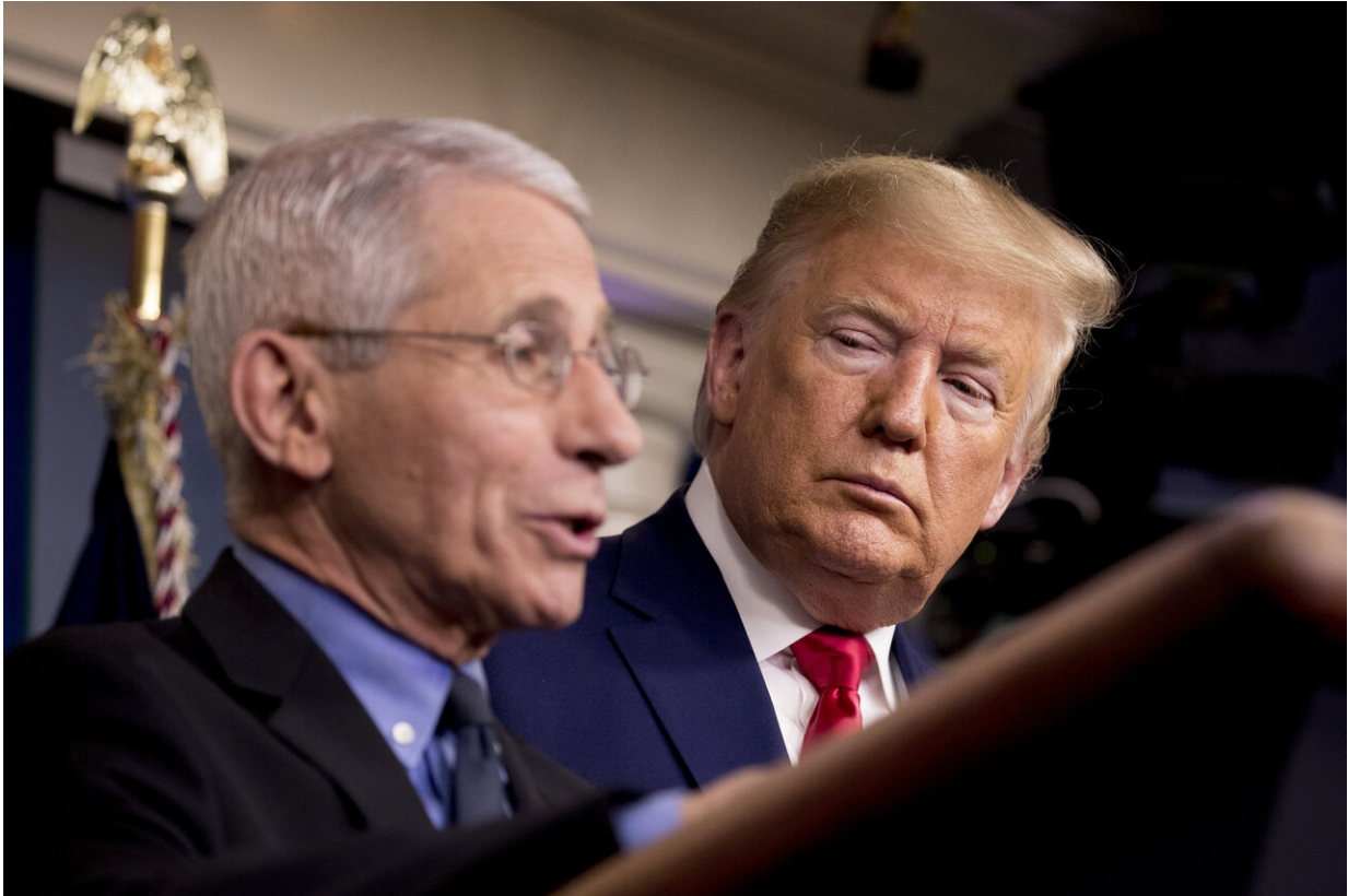
National Institute for Allergy and Infectious Diseases Director Dr. Anthony Fauci, left, accompanied by President Donald Trump, speaks about the coronavirus during a news conference in the press briefing room at the White House, Saturday, Feb. 29, 2020, in Washington.