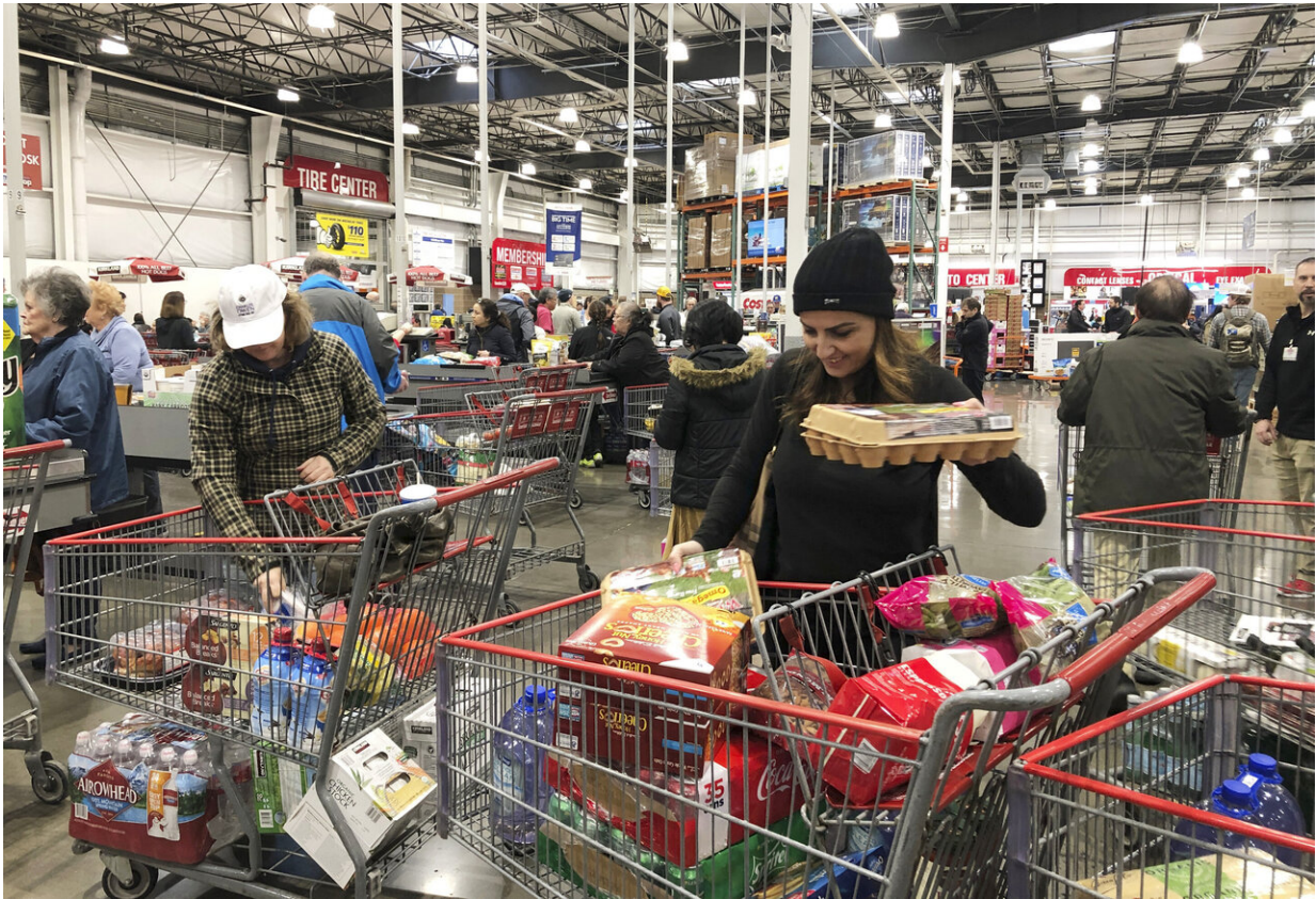
Shoppers visit a Costco Wholesale in Tigard, Ore., Saturday, Feb. 29, 2020, after reports of Oregon's first case of coronavirus was announced in the nearby Oregon city of Lake Oswego on Friday.