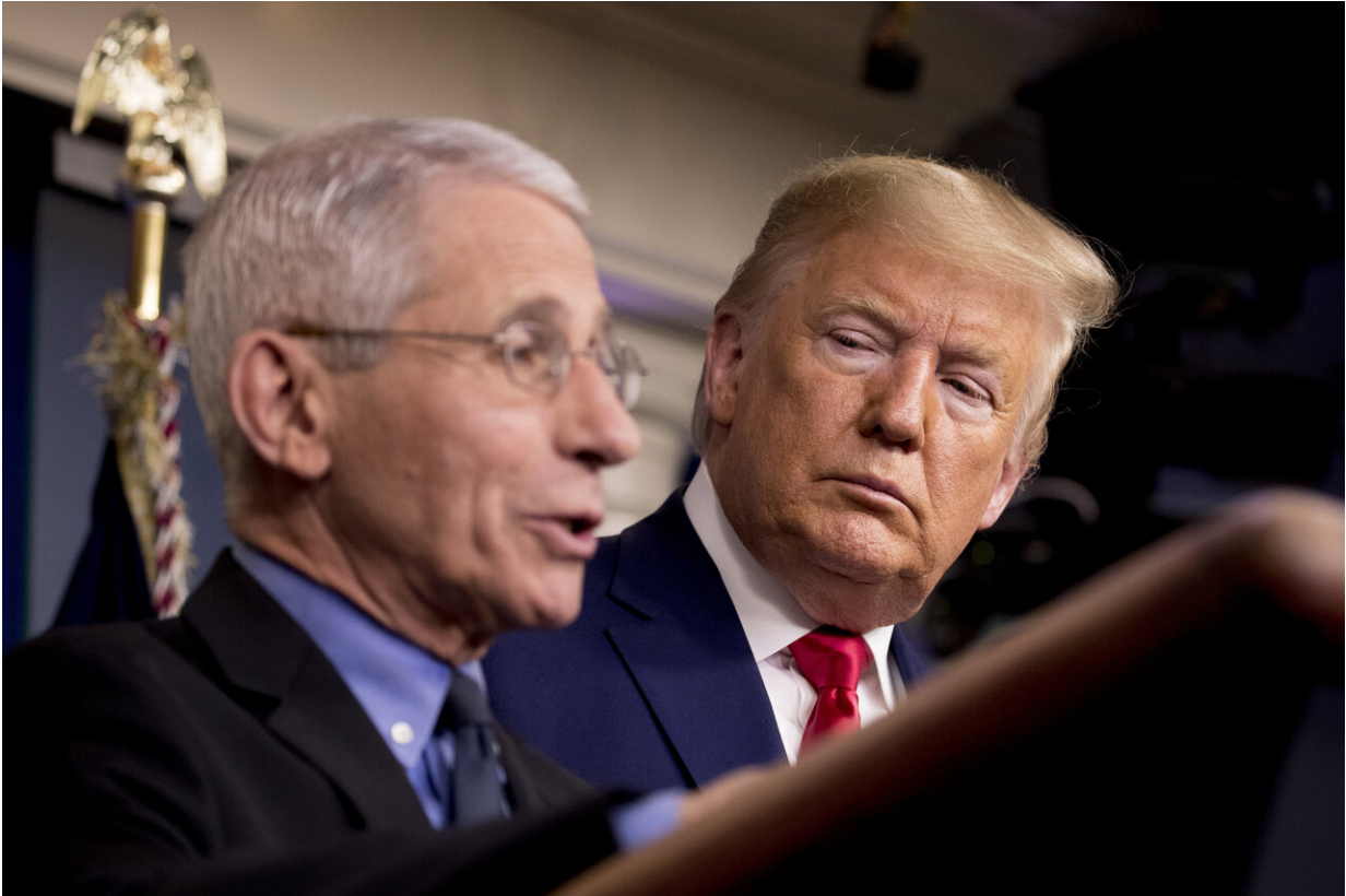
National Institute for Allergy and Infectious Diseases Director Dr. Anthony Fauci, left, accompanied by President Donald Trump, speaks about the coronavirus during a news conference in the press briefing room at the White House, Saturday, Feb. 29, 2020, in Washington.