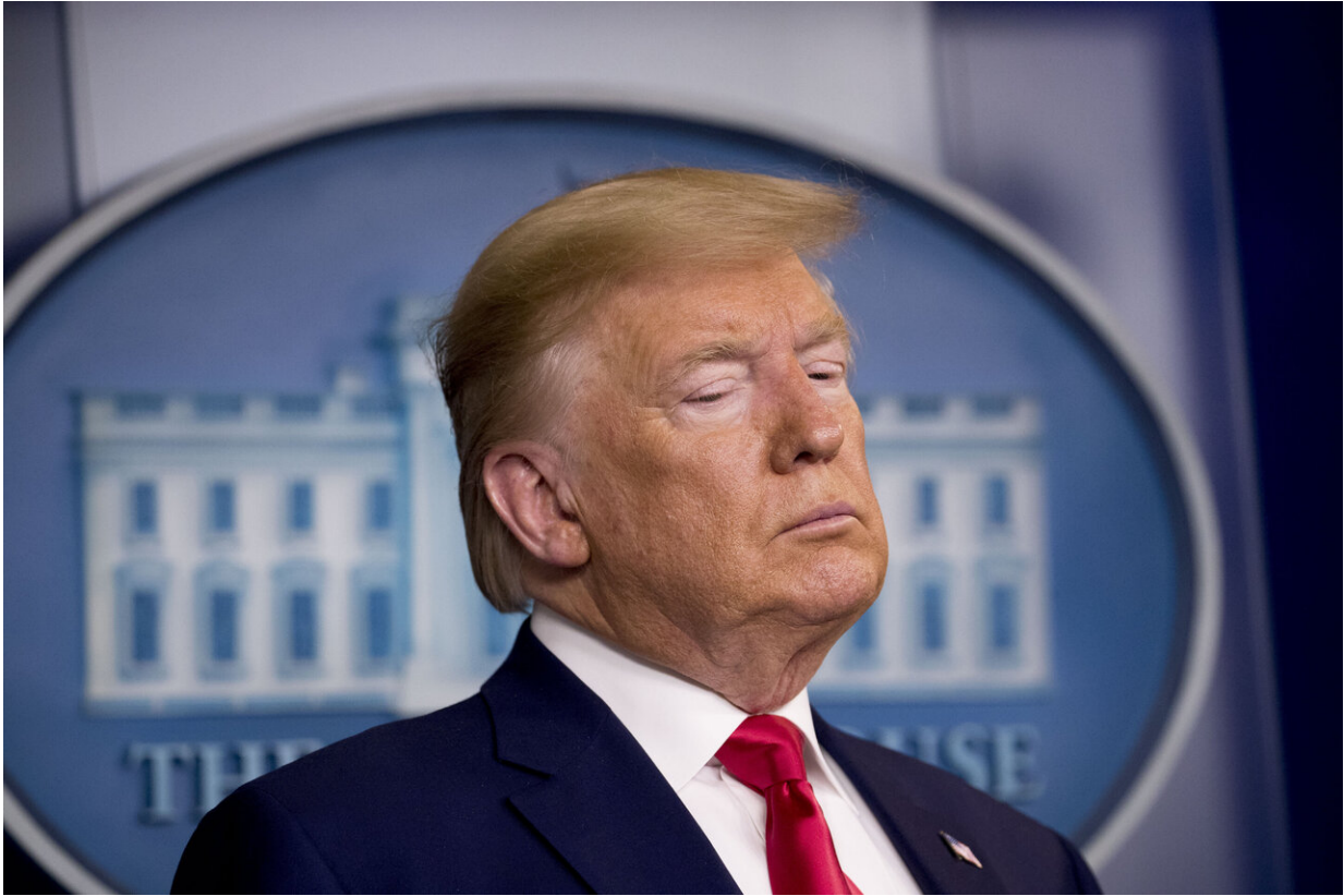
President Donald Trump listens during a news conference about the coronavirus in the press briefing room at the White House, Saturday, Feb. 29, 2020, in Washington.