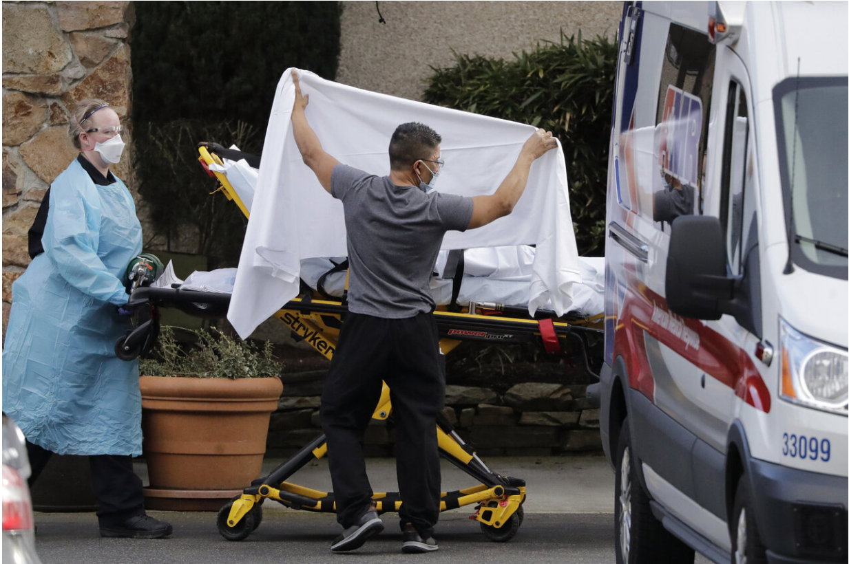
A staff member blocks the view as a person is taken by a stretcher to a waiting ambulance from a nursing facility where more than 50 people are sick and being tested for the COVID-19 virus, Saturday, Feb. 29, 2020, in Kirkland, Wash.