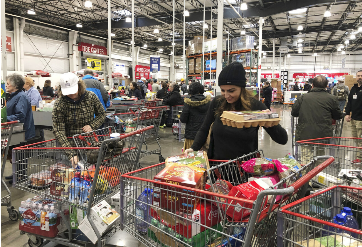
Shoppers visit a Costco Wholesale in Tigard, Ore., Saturday, Feb. 29, 2020, after reports of Oregon's first case of coronavirus was announced in the nearby Oregon city of Lake Oswego on Friday.