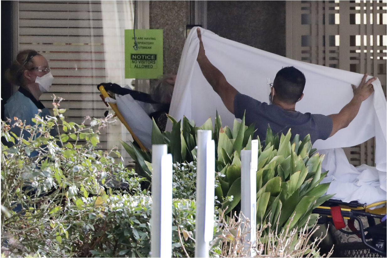
A sign behind warns of a "respiratory outbreak" as a staff member blocks the view, while a person is taken by a stretcher to a waiting ambulance from a nursing facility where more than 50 people are sick and being tested for the COVID-19 virus, Saturday, Feb. 29, 2020, in Kirkland, Wash.