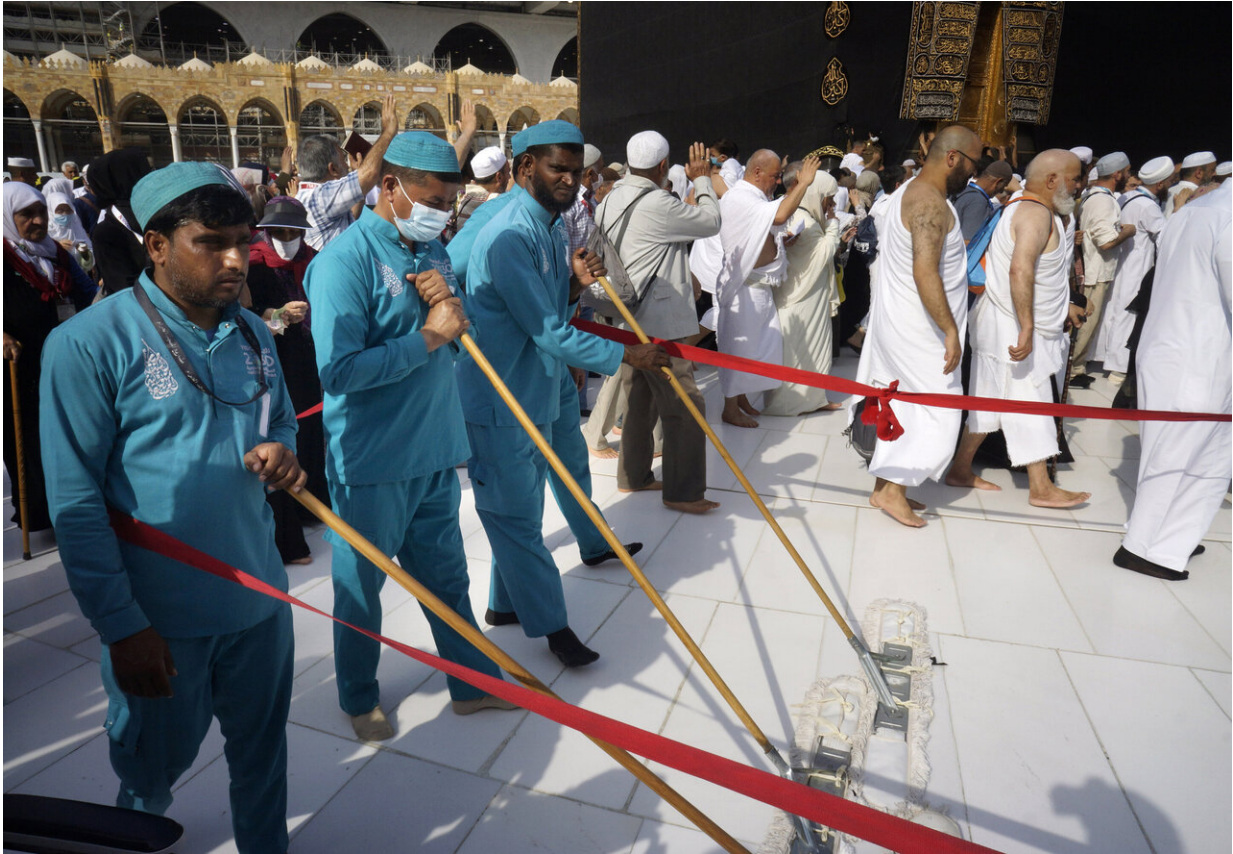
Workers sterilize the ground in front of the Kaaba, the cubic building at the Grand Mosque, in the Muslim holy city of Mecca, Saudi Arabia, Thursday, March 5, 2020. Saudi Arabia's Deputy Health Minister Abdel-Fattah Mashat was quoted on the state-linked news site Al-Yaum saying that groups of visitors to Mecca from inside the country would now also be barred from performing the pilgrimage, known as the umrah.