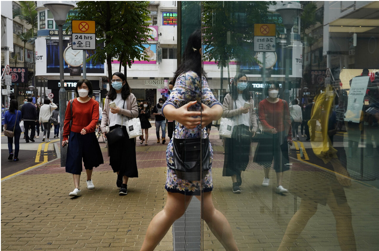
People wearing face masks walk at a street in Hong Kong Friday, March. 13, 2020. For most, the coronavirus causes only mild or moderate symptoms, such as fever and cough. But for a few, especially older adults and people with existing health problems, it can cause more severe illnesses, including pneumonia.