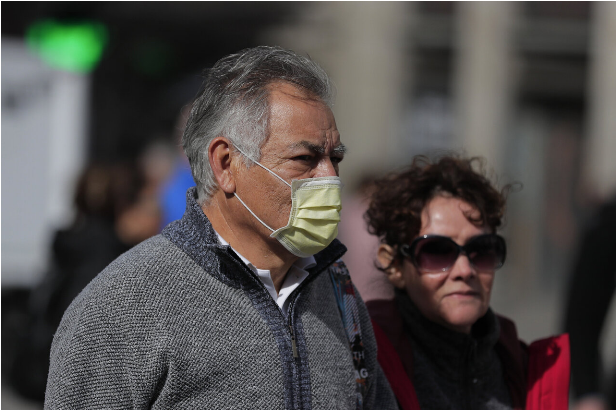
A man wears a face mask in central Madrid, Spain, Monday, March 9, 2020. Health authorities in the Madrid region say that infections for the new coronavirus have more than doubled in the past 24 hours.