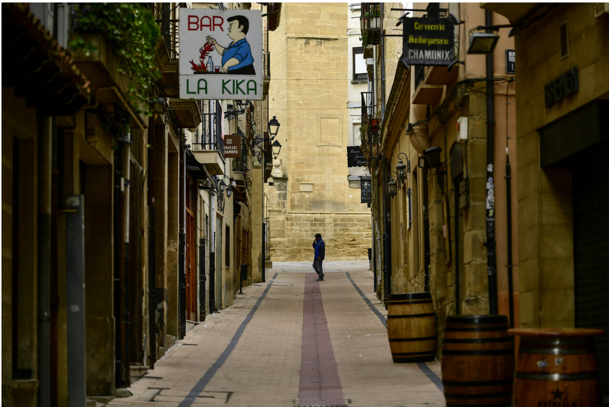
A pedestrian walks along an empty street in the old village of Haro, northern Spain, Monday, March 9, 2020. Health authorities in the Madrid region say that infections for the new coronavirus have more than doubled in the past 24 hours.

For weeks, authorities have repeated that the vast majority of the cases were imported or linked to people who had traveled abroad.