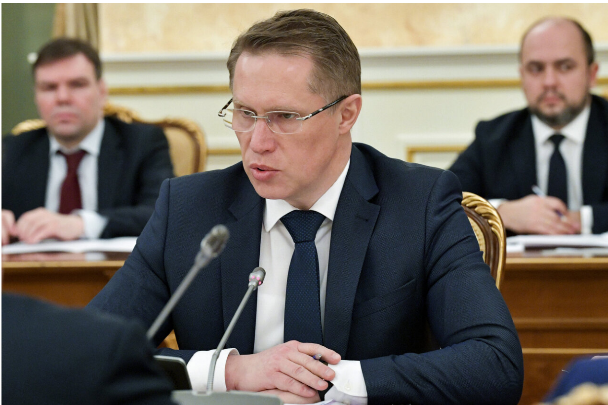
Russian Healthcare Minister Mikhail Murashko attends a coronavirus cabinet meeting with Russian Prime Minister Mikhail Mishustin in Moscow, Russia,

Putin has hailed Moscow's lockdown as "necessary and justified." St. Petersburg, Russia's second largest city, and over a dozen other regions from the westernmost exclave of Kaliningrad to Tatarstan on the Volga River to the Yekaterinburg region in the Urals quickly followed Moscow's example and imposed similar lockdowns.