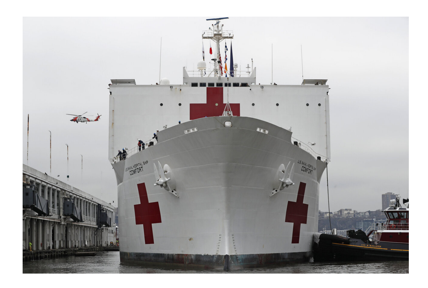
A U.S. Coast Guard helicopter flies overhead as the USNS Comfort, a naval hospital ship with a 1,000 bed-capacity, docks at Pier 90, Monday, March 30, 2020, in New York. The ship will be used to treat New Yorkers who don't have coronavirus as land-based hospitals fill up with and treat those who do.

The opera singer's illness comes after his own glittering career had recently been marred by sexual misconduct revelations.