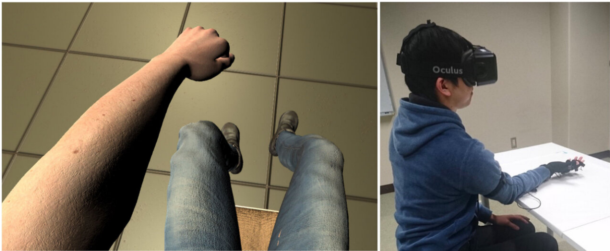
Image on the HMD (left) and a participant (right)

Twenty participants moved the right thumb voluntarily when they observed a virtual left arm through a head-mounted display for five minutes. The virtual left arm was either synchronized or asynchronized with the right thumb. It was found that participants felt as if their right thumb had become the left arm and the virtual left arm was a part of their own body in the synchronous condition. However, the sense of ownership was not very strong, suggesting that the re-association of different body parts may be weaker than natural association. This may be because the re-association was performed for only five minutes in the experiment.