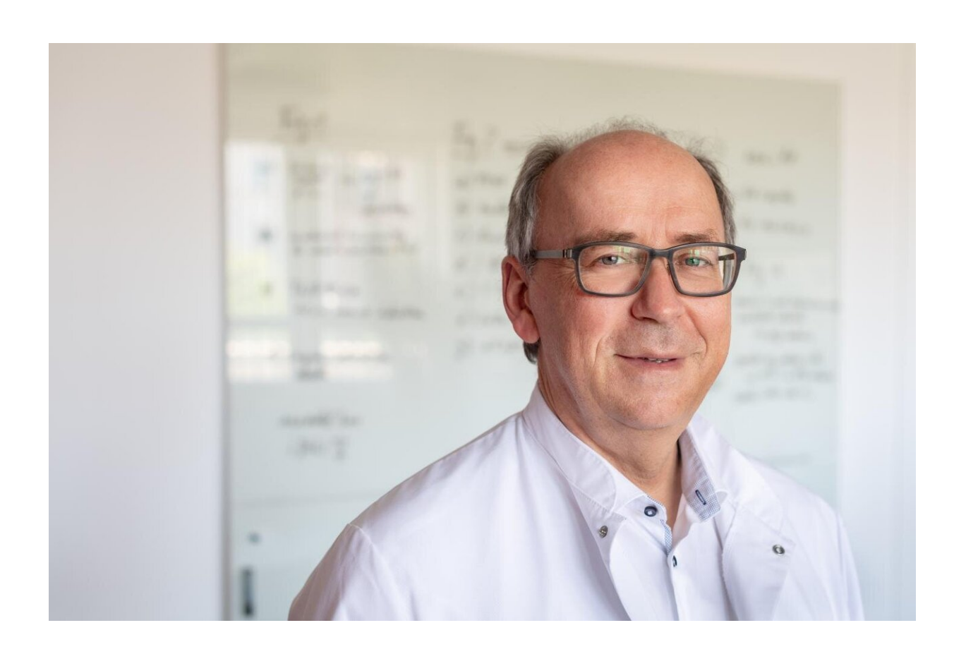
Prof. Percy A. Knolle

Our immune system not only protects us against infection, but also against cancer. This powerful protection is based in particular on the activation of special cells of the immune system, CD8+ T cells. These cells recognize infected or cancer cells and kill them specifically.