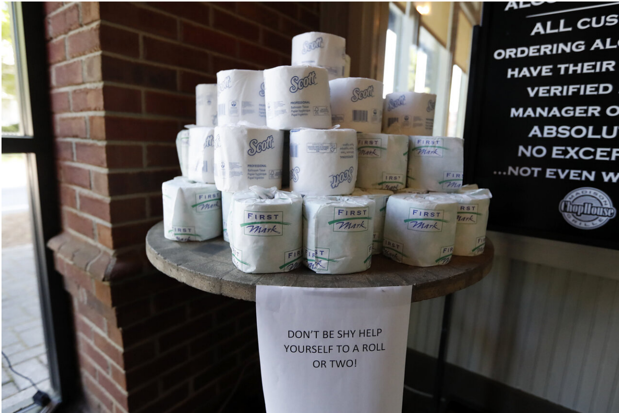
Madison Chop House Grille offers customers free toilet paper Monday, April 27, 2020, in Madison, Ga. The steakhouse located in the historic district of Madison is preparing to shift from take out only to dine-in service after Gov. Brian Kemp eased restrictions on restaurants.