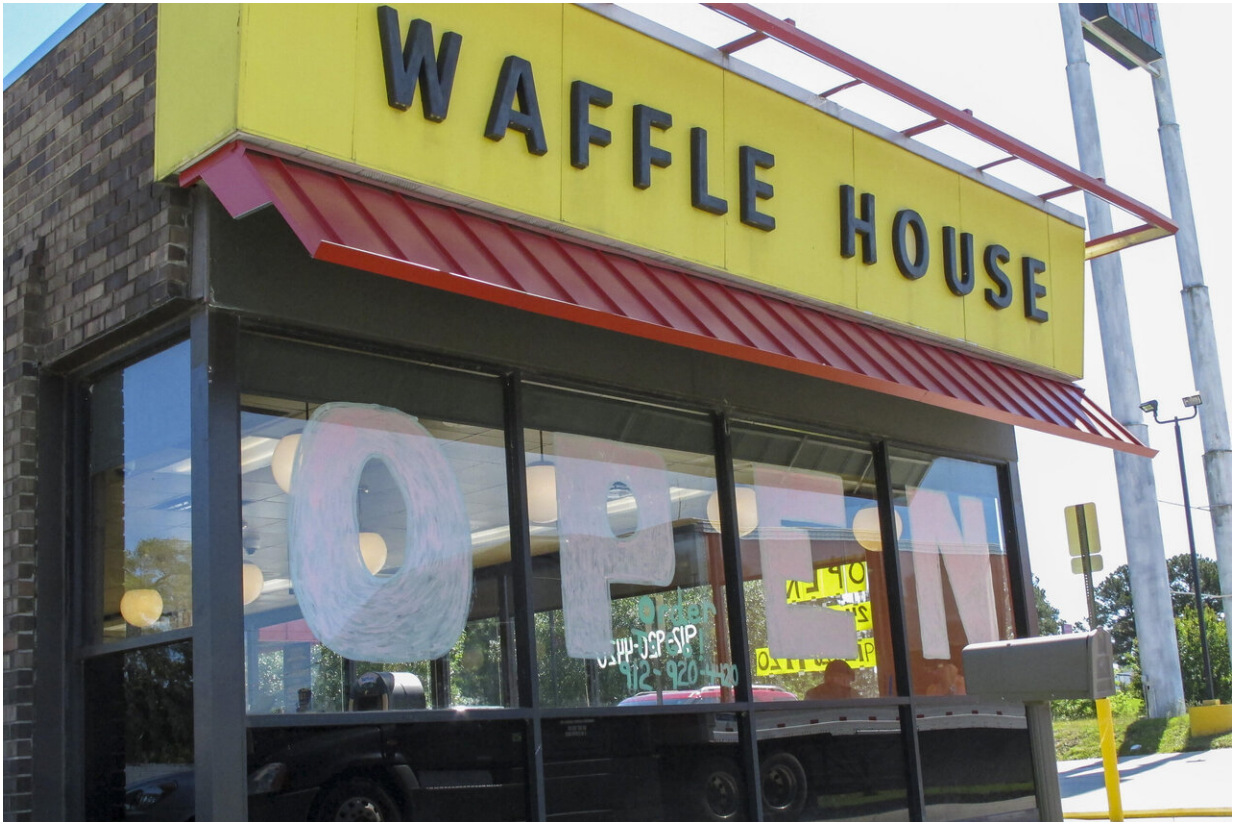
A Waffle House restaurant has "OPEN" painted across its windows on Monday, April 27, 2020 in Savannah, Georgia, as restaurants statewide were allowed to resume dine-in service with restrictions.