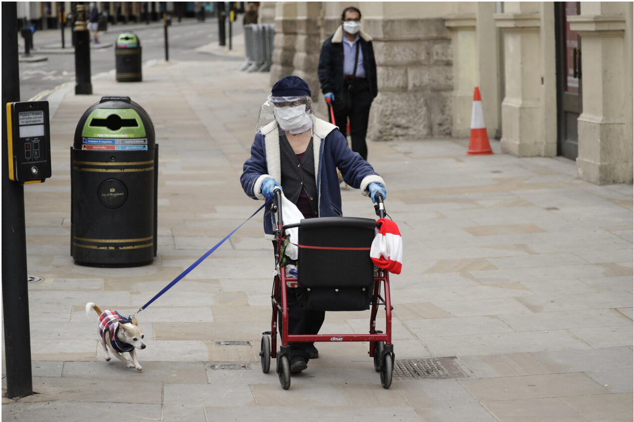
A woman wearing a home made face shield and mask walks a dog near Piccadilly Circus in central London, Sunday, May 3, 2020. The highly contagious COVID-19 coronavirus has impacted on nations around the globe, many imposing self isolation and exercising social distancing when people move from their homes.