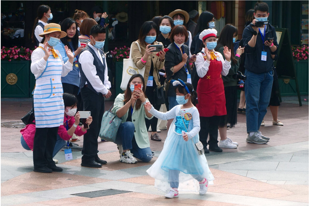
A young visitor, wearing face masks, waves as she enters the Disneyland theme park in Shanghai as it reopened, Monday, May 11, 2020. Visits will be limited initially and must be booked in advance, and the company said it will increase cleaning and require social distancing in lines for the various attractions.