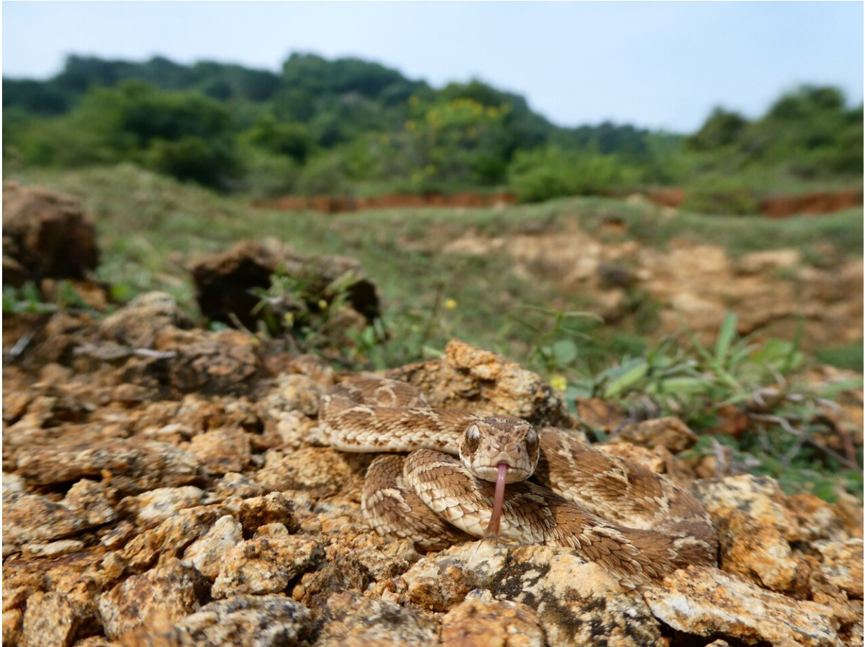
The Indian saw-scaled viper Echis carinatus in situ in Tamil Nadu