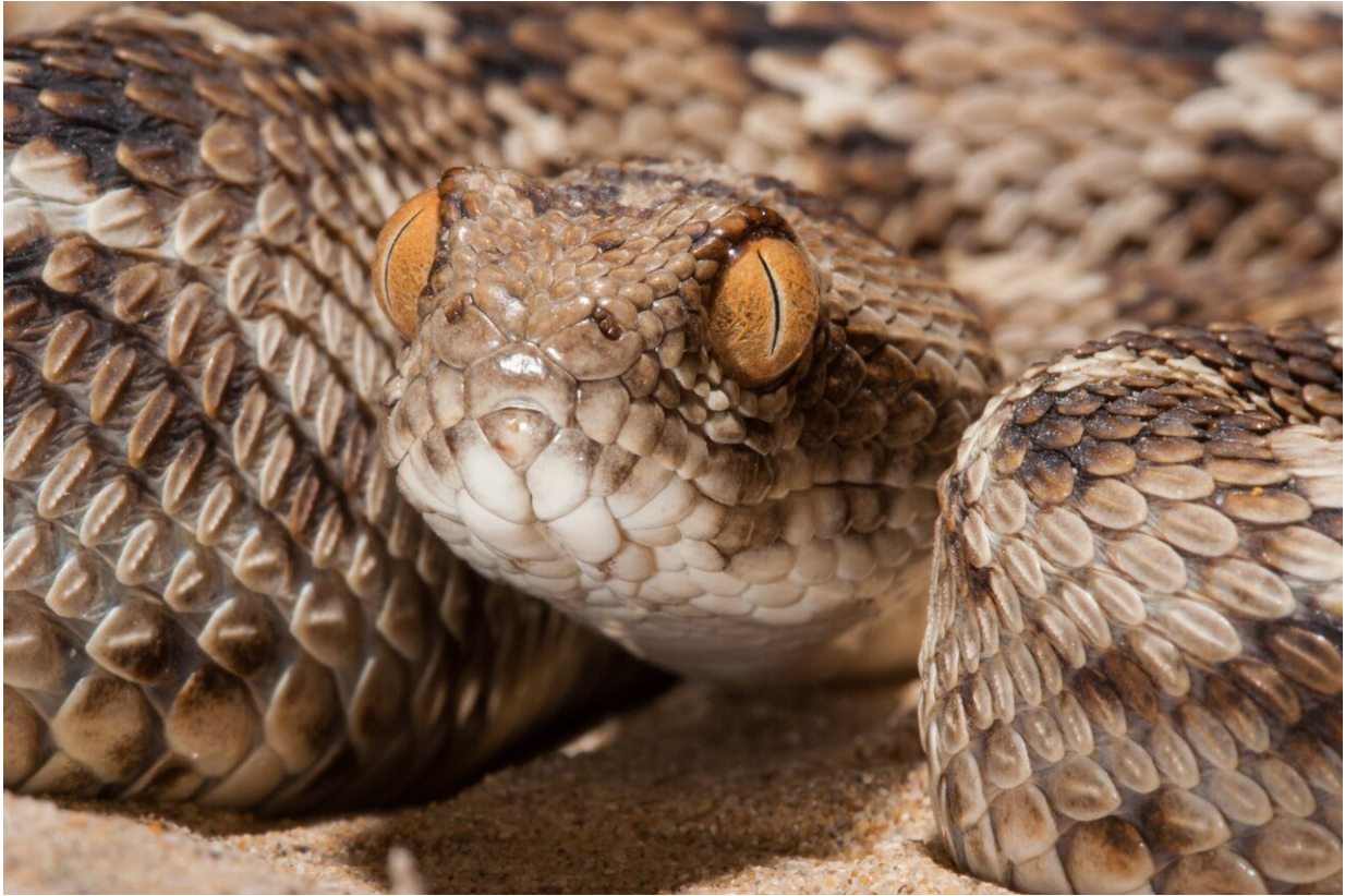
Sochurek's saw-scaled viper Echis carinatus sochureki from the United Arab Emirates.