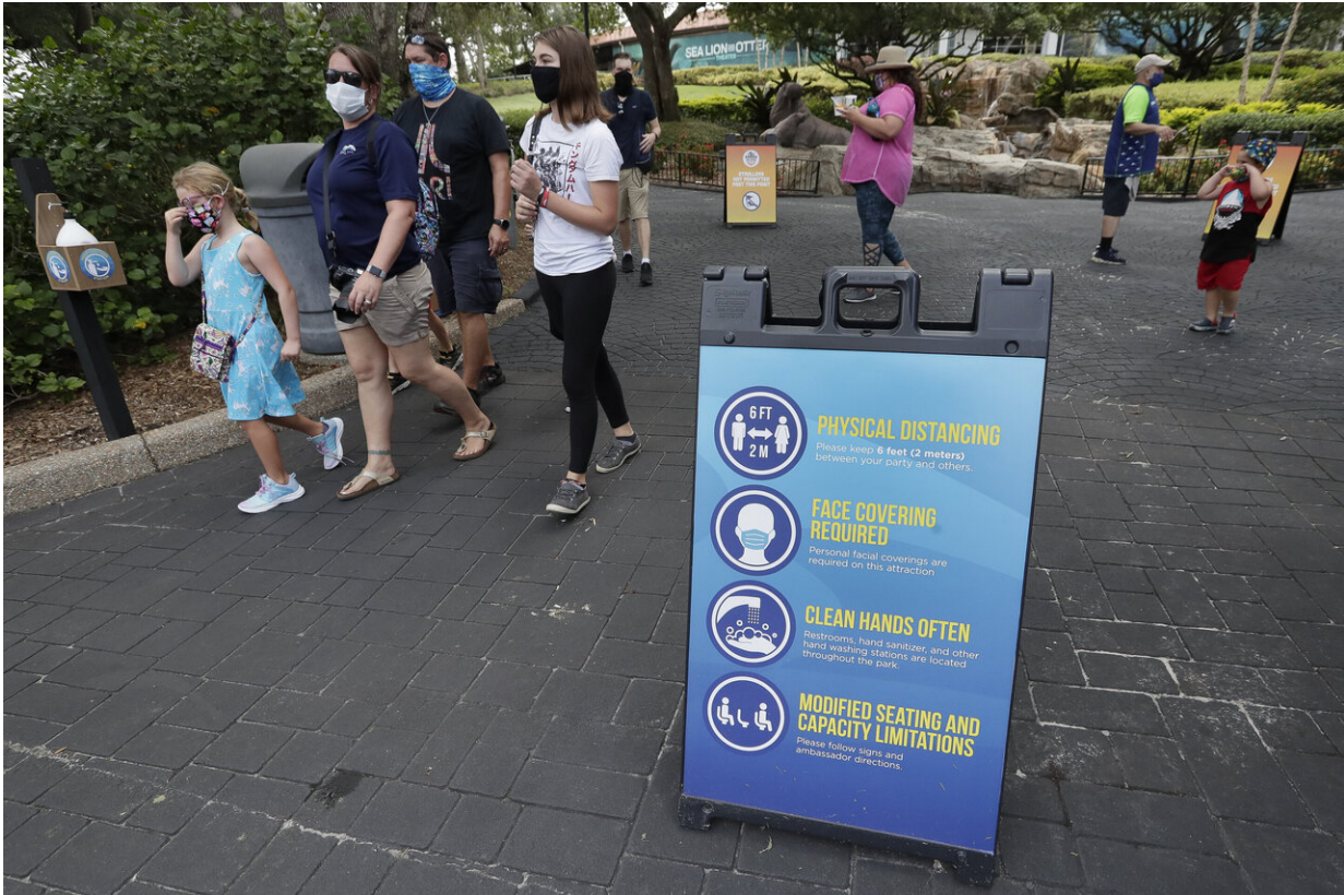
Signs remind guests of new safety measures in place at SeaWorld as it reopened, Thursday, June 11, 2020, in Orlando, Fla. The park had been closed since mid-March to stop the spread of the new coronavirus.