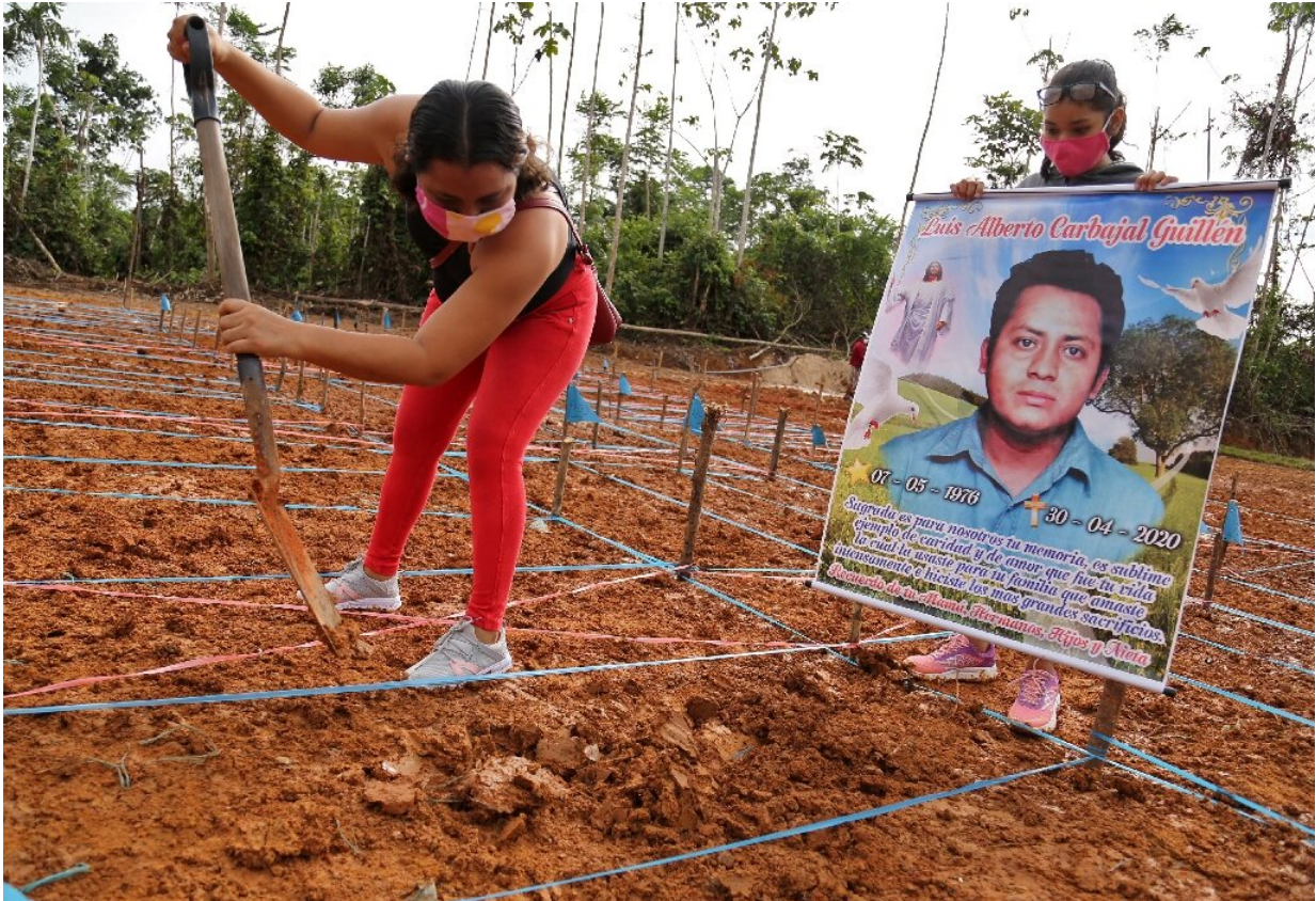
A relative digs the grave of a coronavirus victim in Peru, as Latin America is hit hard in the pandemic

While opposition Democrats have urged Trump to reissue an emergency declaration on coronavirus , White House Press Secretary Kayleigh McEnany said Monday the president had "no interest" in doing so.