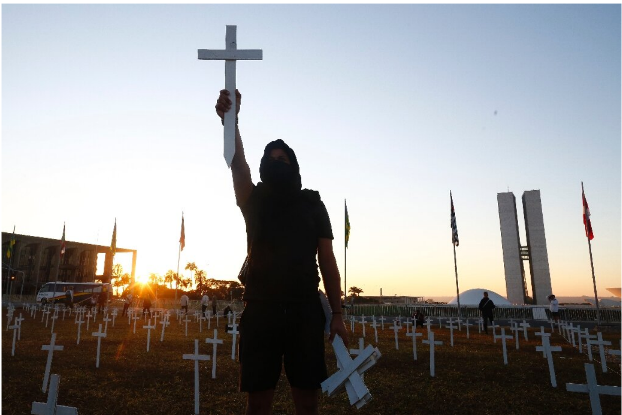
One of thousands of protesters demonstrating across Brazil against the pandemic response of President Jair Bolsonaro

While bars were forced to close in Los Angeles, Ireland's pubs began pouring pints for the first time in 15 weeks, as Europe—still the hardest-hit continent—continues to open up after seeing numbers of new cases fall.