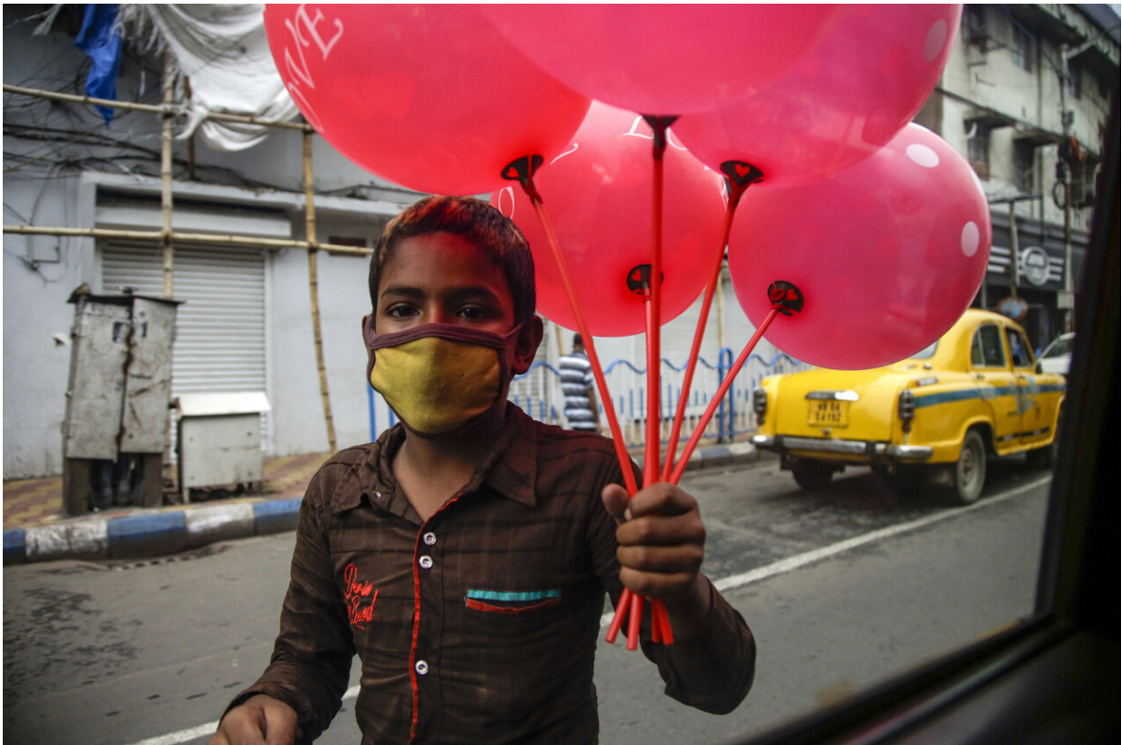
A boy wearing a face mask sells balloons on a street in Kolkata, India, Friday, June 19, 2020. India is the fourth hardest-hit country by the COVID-19 pandemic in the world after the U.S., Russia and Brazil.

Meanwhile, India recorded 13,586 newly confirmed cases on Friday, raising its total to 380,532. Still, shops, malls, factories and places of worship have been allowed to reopen while schools and cinemas remain shuttered.