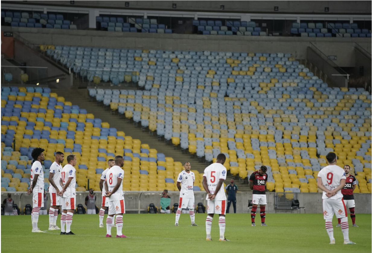
Players of Bangu, wearing white uniforms, and Flamengo pay a minute of silence for the victims of the coronavirus prior to a Rio de Janeiro soccer league match at the Maracana stadium in Rio de Janeiro, Brazil, Thursday, June 18, 2020. Rio de Janeiro's soccer league resumed after a three-month hiatus because of the coronavirus pandemic. The match is being played without spectators to curb the spread of COVID-19.