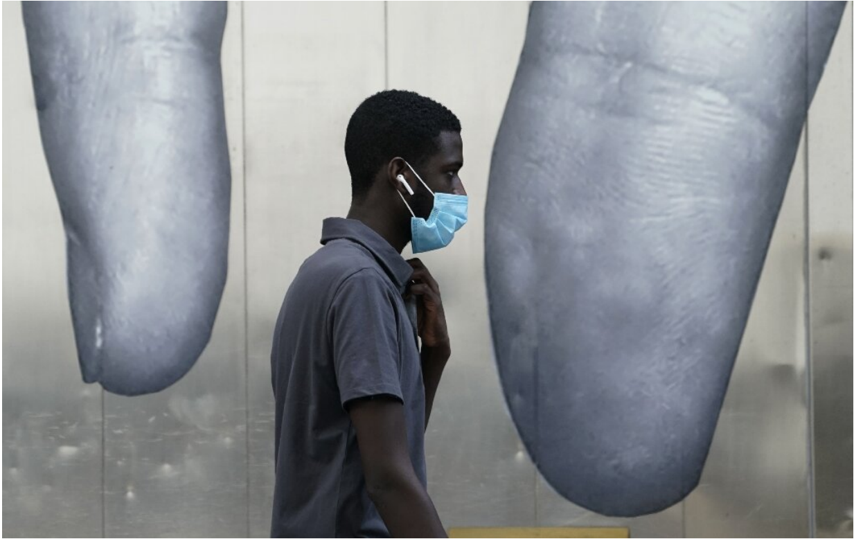
A man wearing a mask passes a mural on the side of a building in New York City