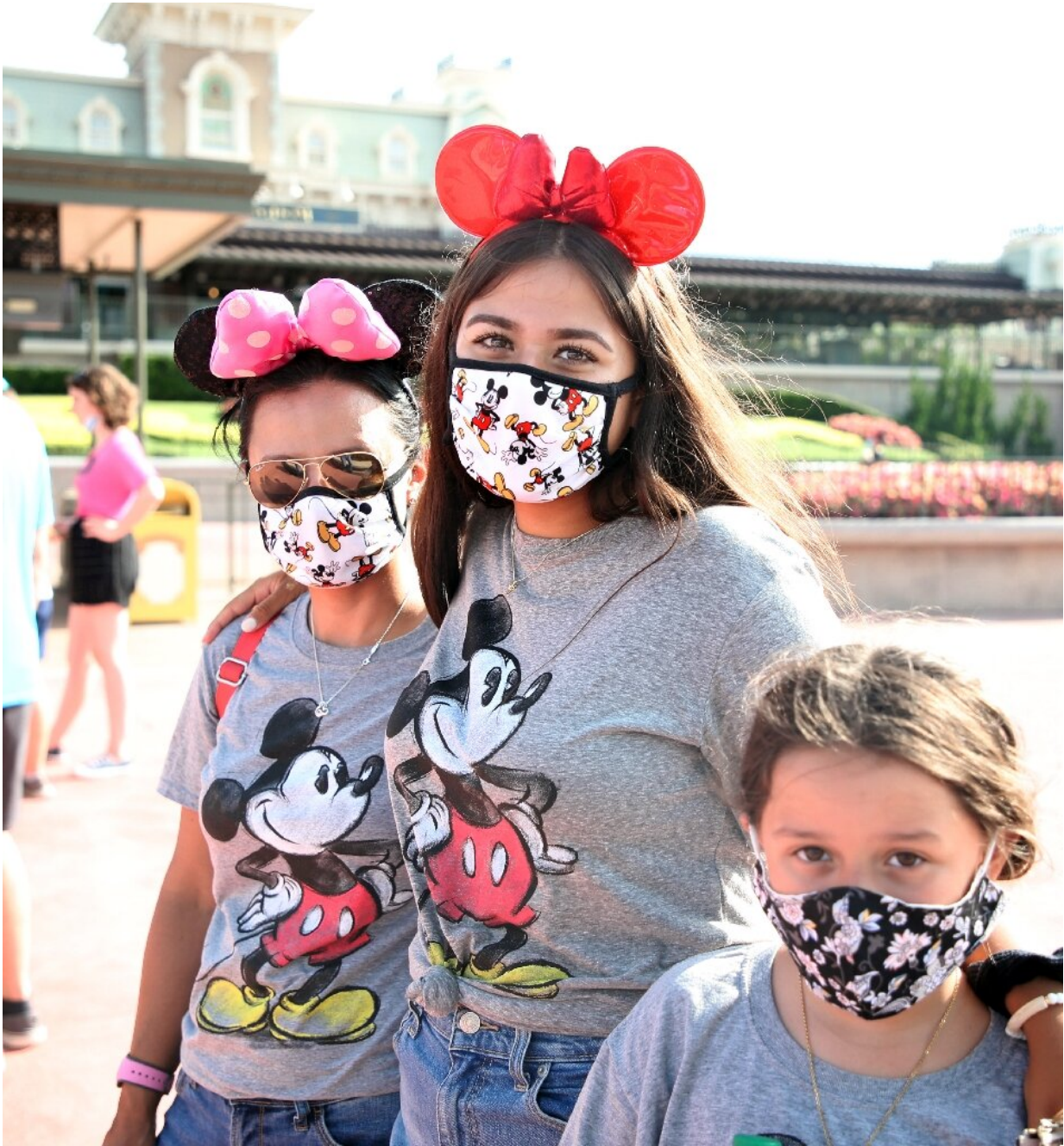
In hard-hit Florida the Walt Disney World theme park partially reopened after four months of shutdown, with some visitors combining Mickey ears with their mandatory face masks