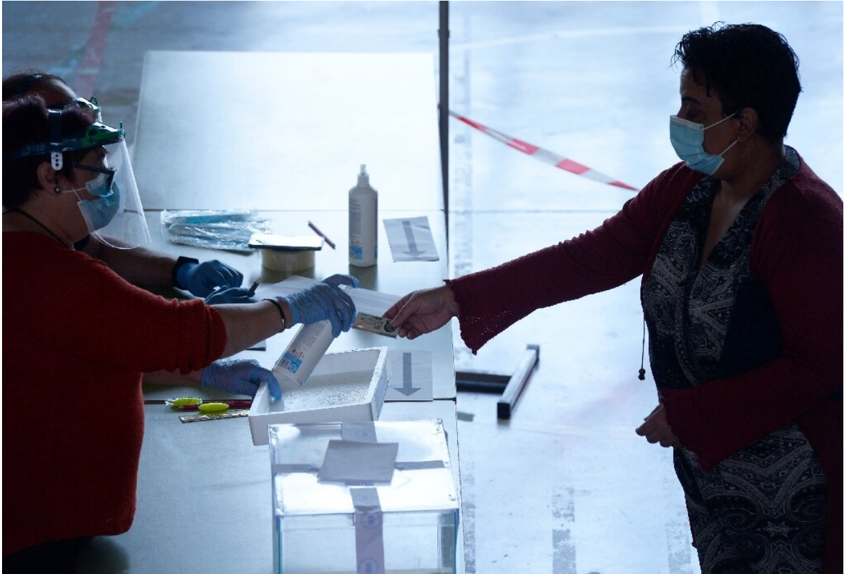
Strict hygiene measures were in place for regional elections in Spain