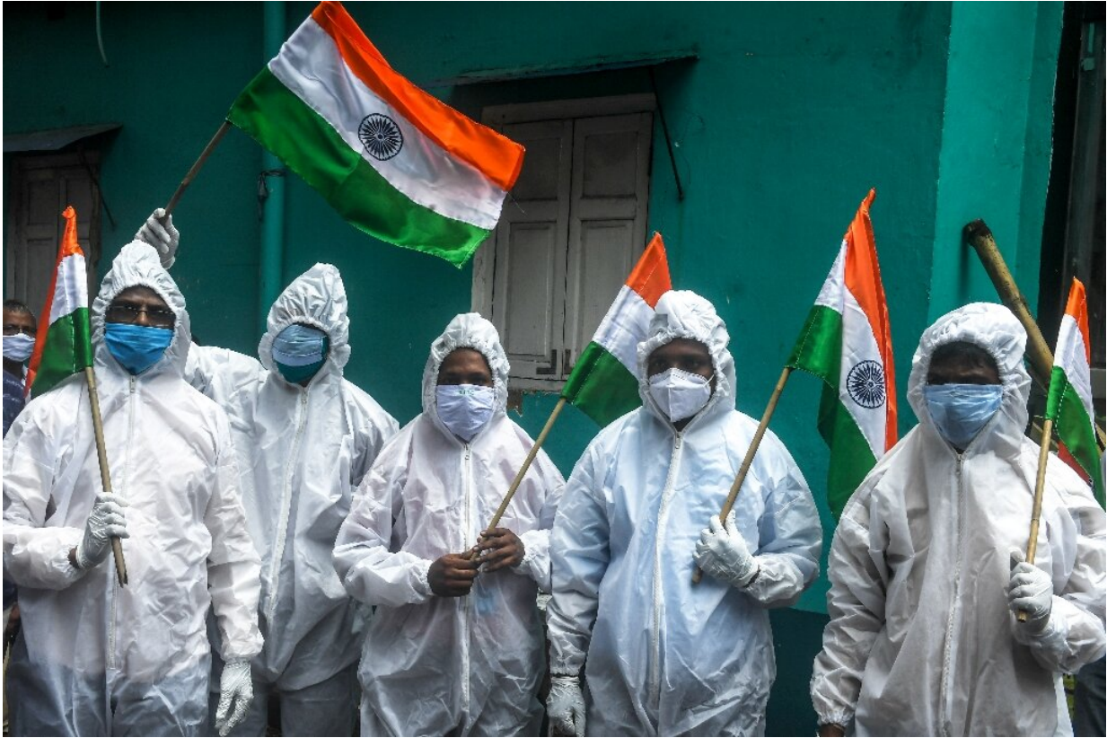
Indians on the coronavirus frontline such as medics and crematorium workers wear personal protective equipment as they mark Independence Day celebrations in Kolkata