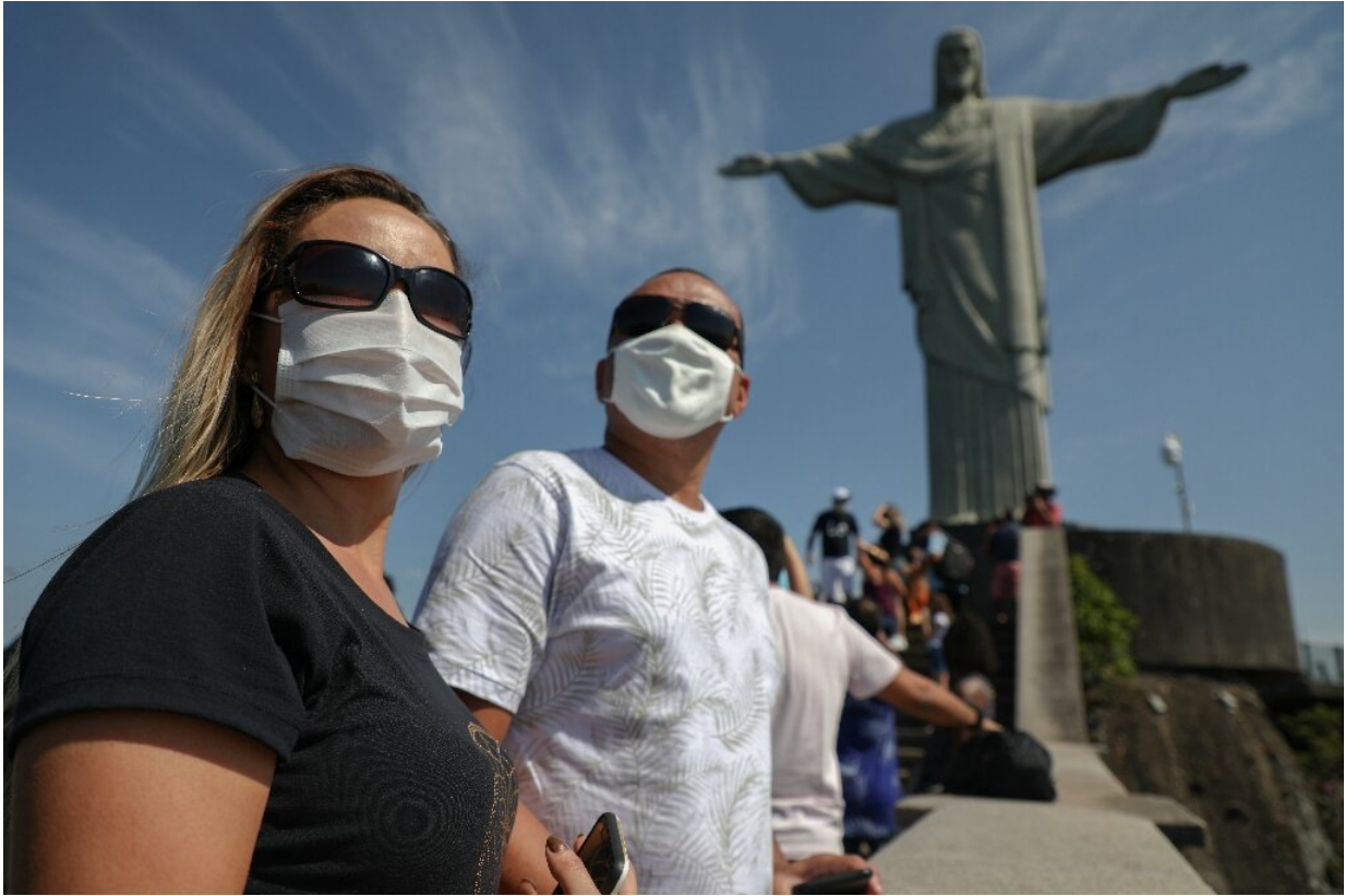
Tourists enjoy a visit to the Christ the Redeemer statue in Rio de Janeiro, Brazil, on August 15, 2020, during the reopening day of tourist attractions in the city