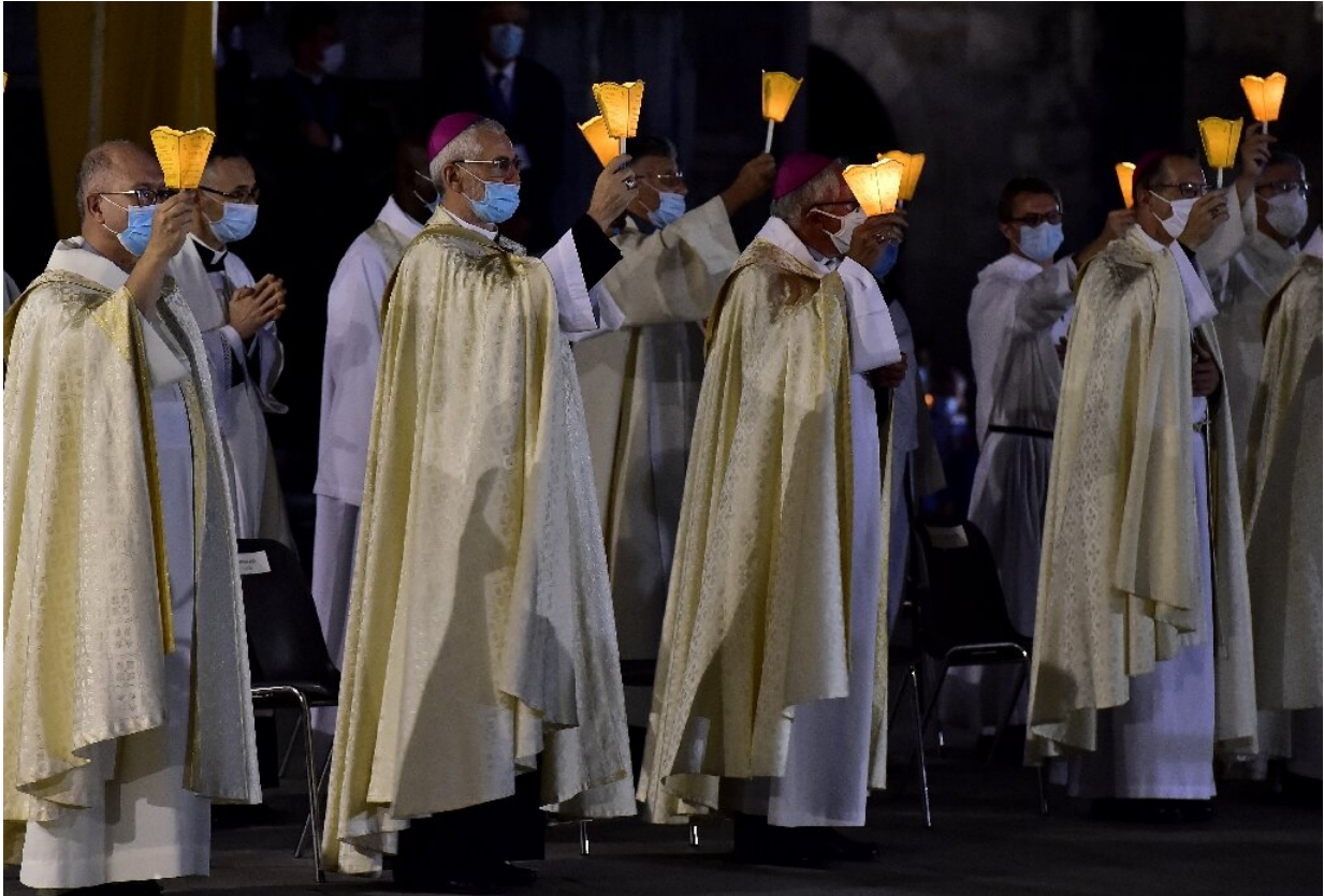
Prelates wearing face masks hold candles as they attend the 147th Assumption pilgrimage mass in France's Lourdes shrine on August 14, 2020