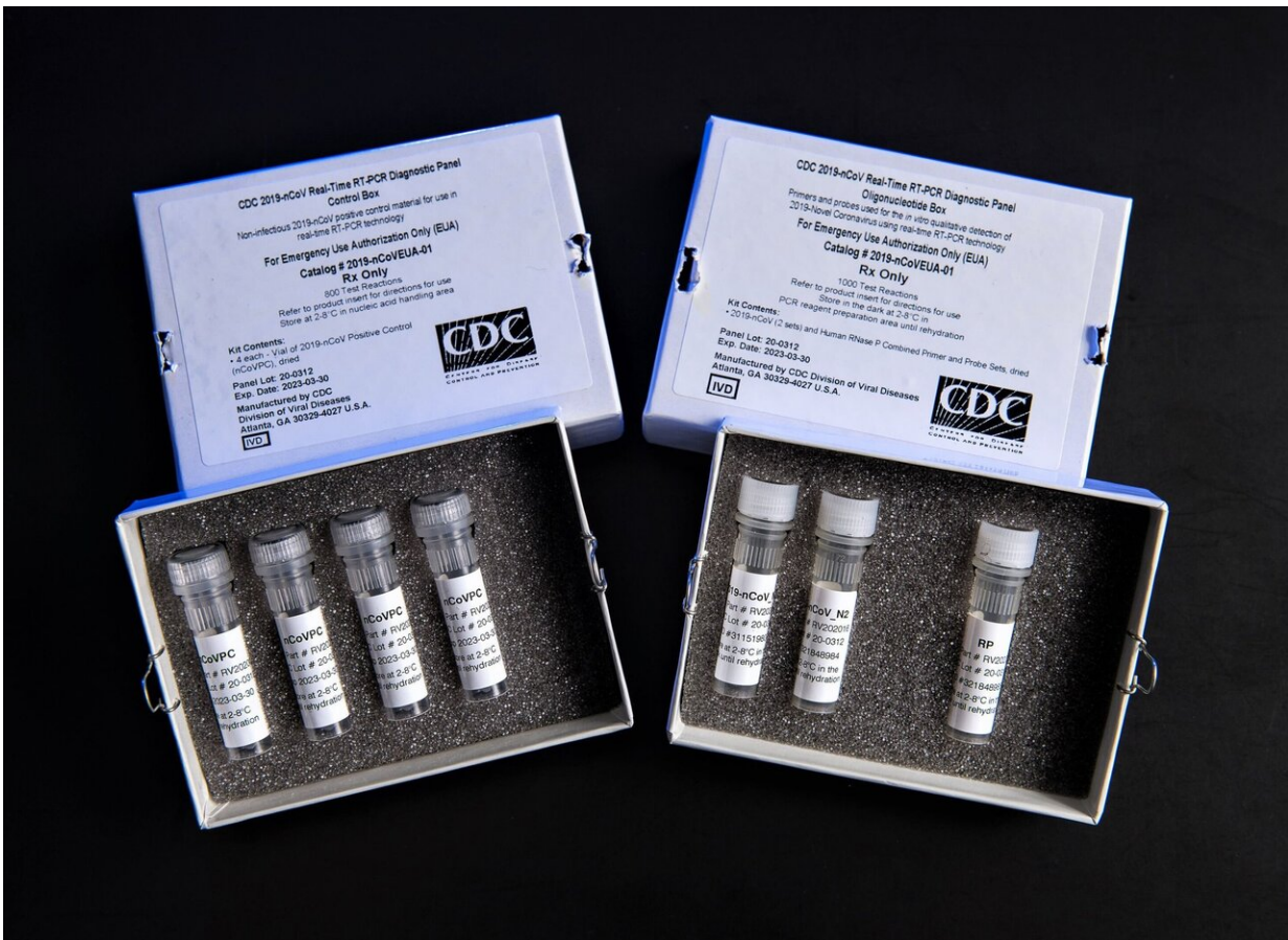
Boxes included in CDC's laboratory test kit for SARS-CoV-2.

"We need more testing," is a phrase that we've heard throughout the SARS-CoV-2 pandemic.