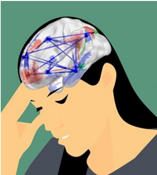
Fig. 1. What is the network mechanism of rumination? Credit: CHEN Xiao

Rumination is generally defined as a recurrent and passive focus of thoughts on depressed mood itself and its possible causes and consequences. Sometimes stated as "overthinking," rumination plays a pivotal role in the onset, maintenance and phenomenology of major depressive disorder (MDD). However, the neural mechanism behind this thinking style remains largely elusive.