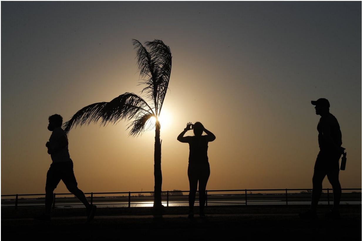
People are silhouetted against the sky with a setting sun in Asuncion, Paraguay, Saturday, Aug. 1, 2020, amid the new coronavirus pandemic.