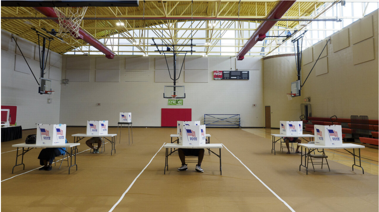
People vote at the Brainerd Youth and Family Development Center on Saturday, Aug. 1, 2020 in Chattanooga, Tenn. Saturday marked the end of the early voting period.