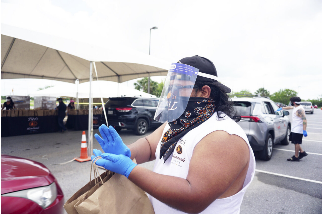
Austin, Texas made Tito's Handmade Vodka visits Brownsville, Texas Sports Park Saturday, Aug. 1, 2020, to distribute thousands of Tito's made hand cleanser sanitizer to thousands of Brownsville residents to help fight the spread of COVID-19.