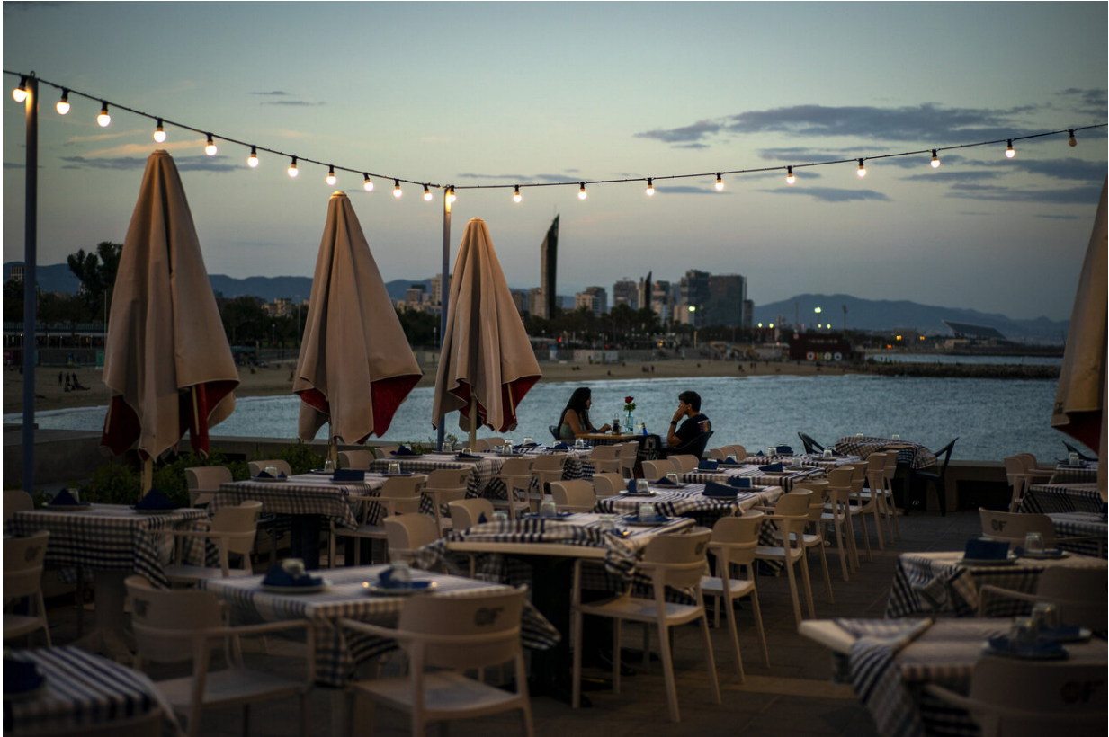
A couple have dinner in an empty restaurant next to the beach in Barcelona, Spain, Wednesday Sept. 23, 2020. Spain is struggling to contain a second wave of the virus which has killed at least 30,000 people according to the country's health ministry.