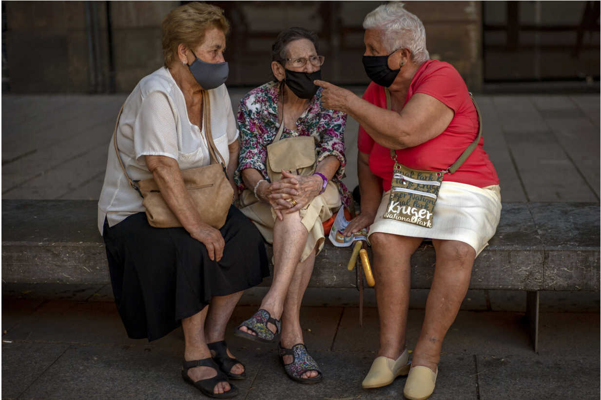
Women wearing face masks to prevent the spread of coronavirus talk as they sit in a square in Barcelona downtown, Spain, Wednesday Sept. 23, 2020. Spain is struggling to contain a second wave of the virus which has killed at least 30,000 people according to the country's health ministry.