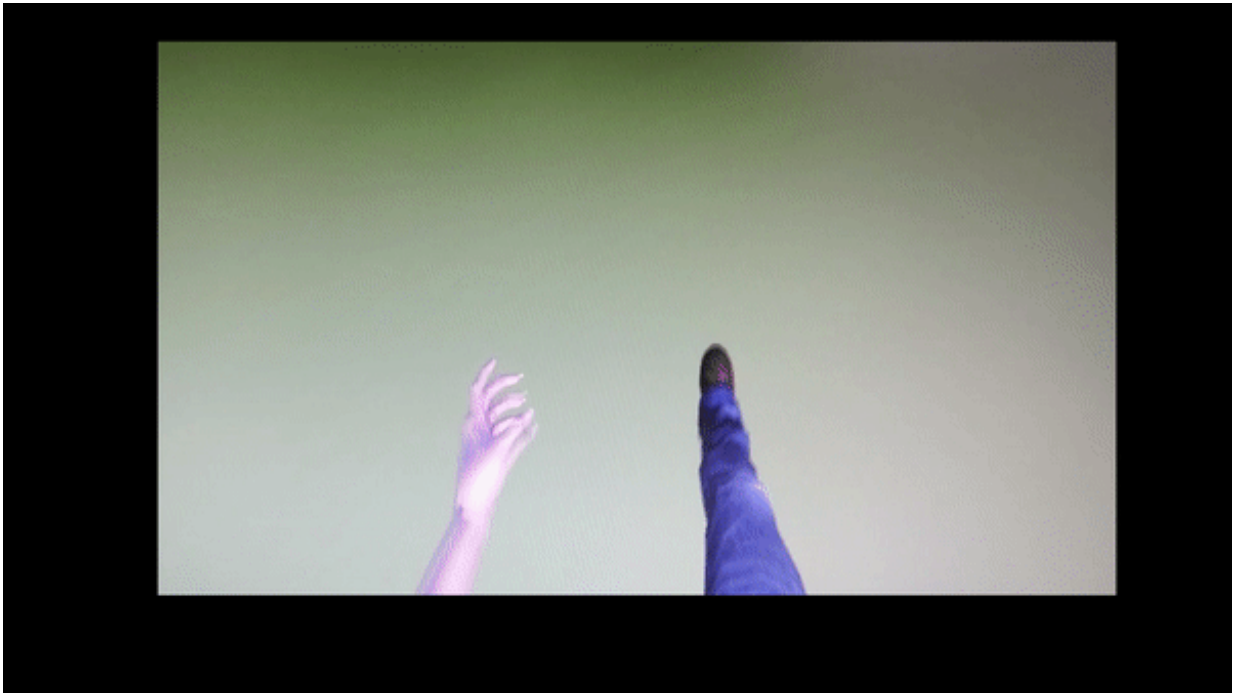
The virtual body as experienced by the user.

Researchers found that participants' heart rate increased coherently with the virtual movements, despite the fact that subjects were completely still; more importantly, cognitive functions (specifically, executive functions) and their neural basis were tested before and after the virtual training. The results showed that participants improved their cognitive performance (specifically, they were faster), as also confirmed by the increased activation of the brain-related areas (specifically, the left dorsolateral prefrontal cortex).