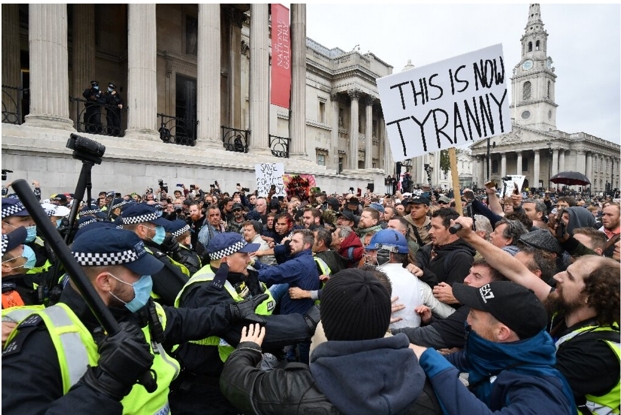
Police move in on lockdown protesters in London's Trafalgar Square

In India, meanwhile, infections closed in on six million on Sunday as Prime Minister Narendra Modi called on people to keep wearing face masks in public.